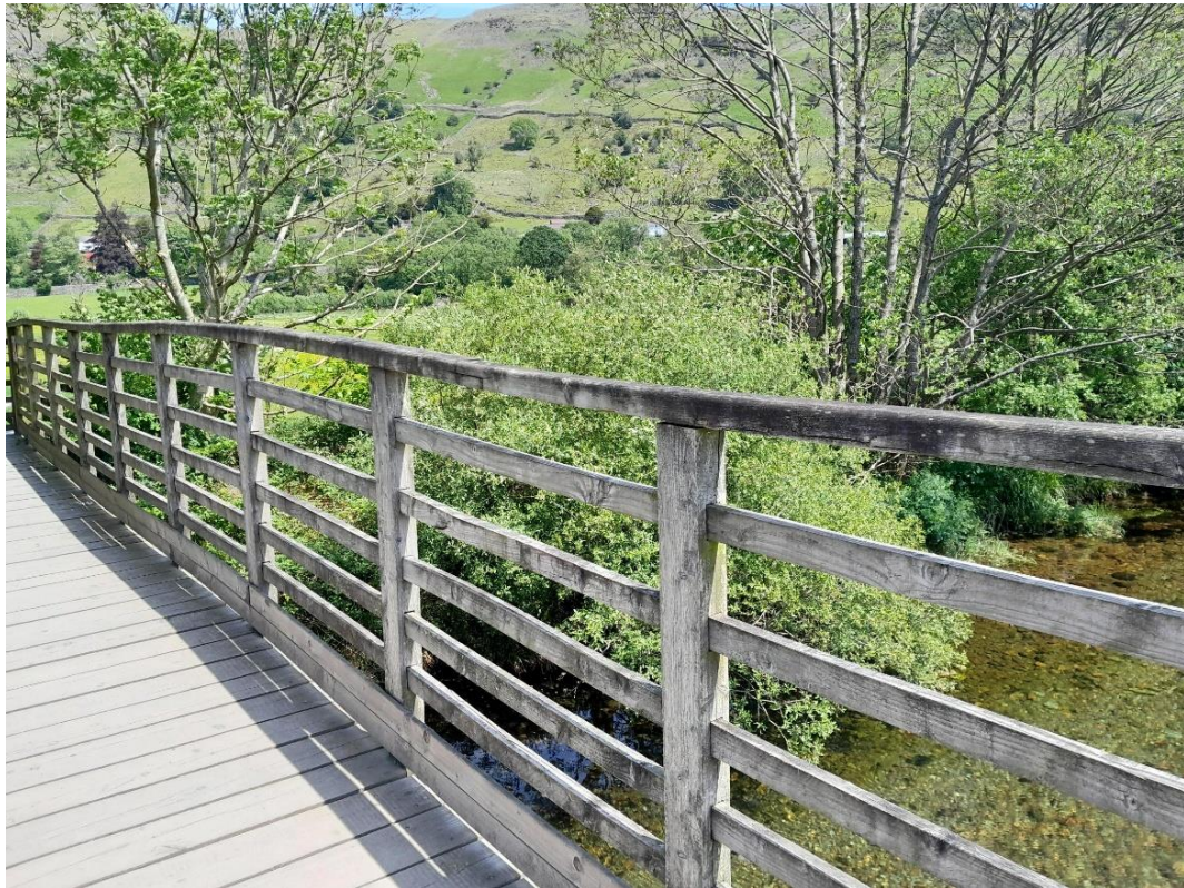
Photo 2 – the handrail uprights are attached to the beam, which has pulled the handrail out of shape