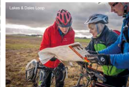
Lakes & Dales Loop