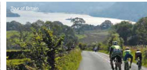
Tour of Britain