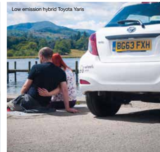
Low emission hybrid Toyota Yaris