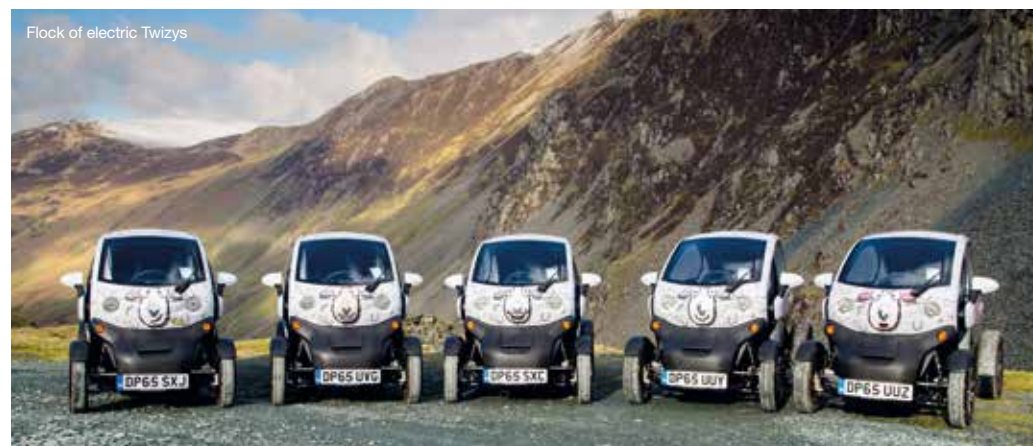
Flock of electric Twizys