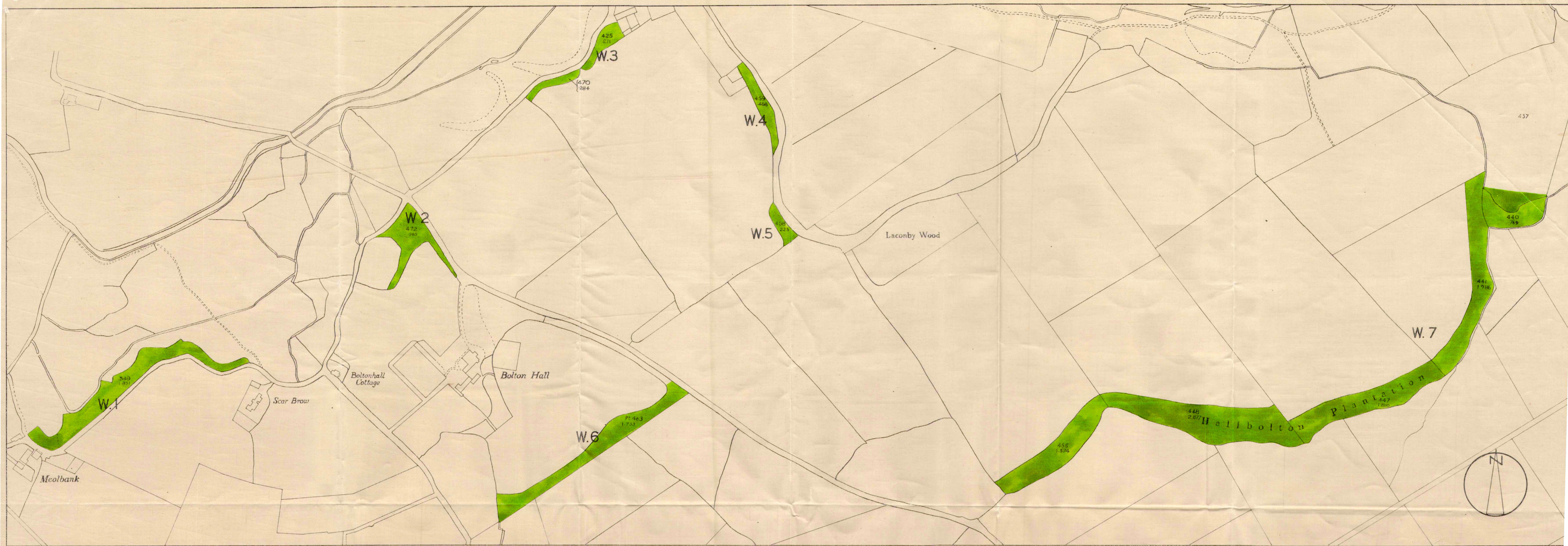
MAP REFERRED TO IN CUMBERLAND COUNTY COUNCIL TREE PRESERVATION (No.21) (BOLTON HALL ESTATE) ORDER 1951