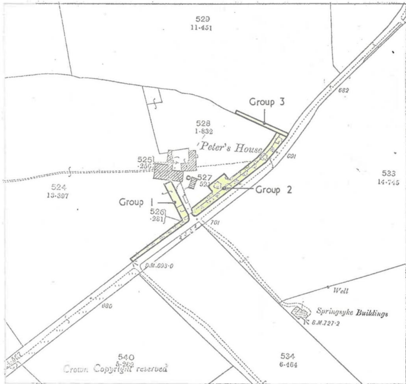
EXTRACT FROM OS SHEET 47—13. EDITION OF 1900. SCALE:—1/2500. JULY 1968.