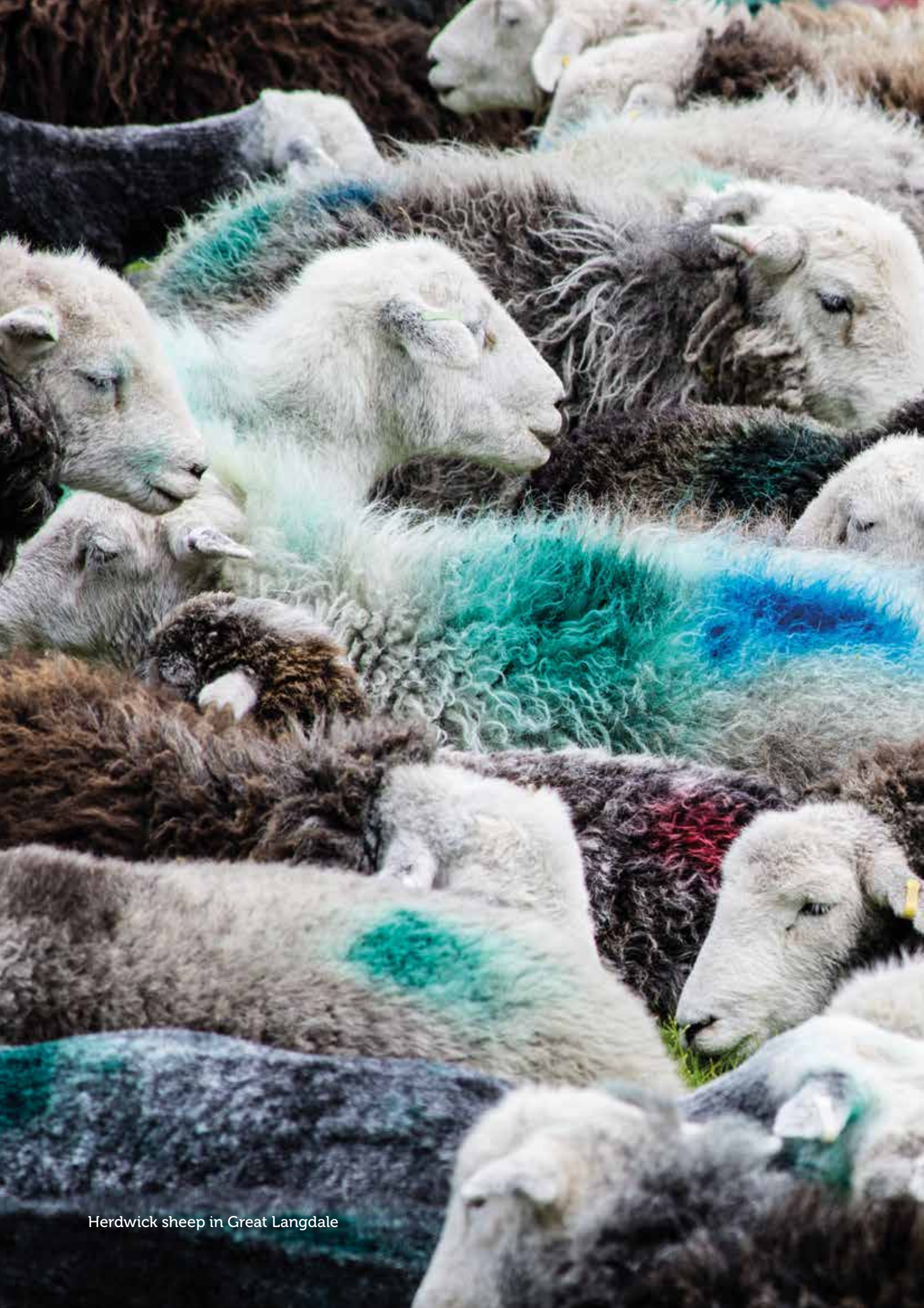
Herdwick sheep in Great Langdale