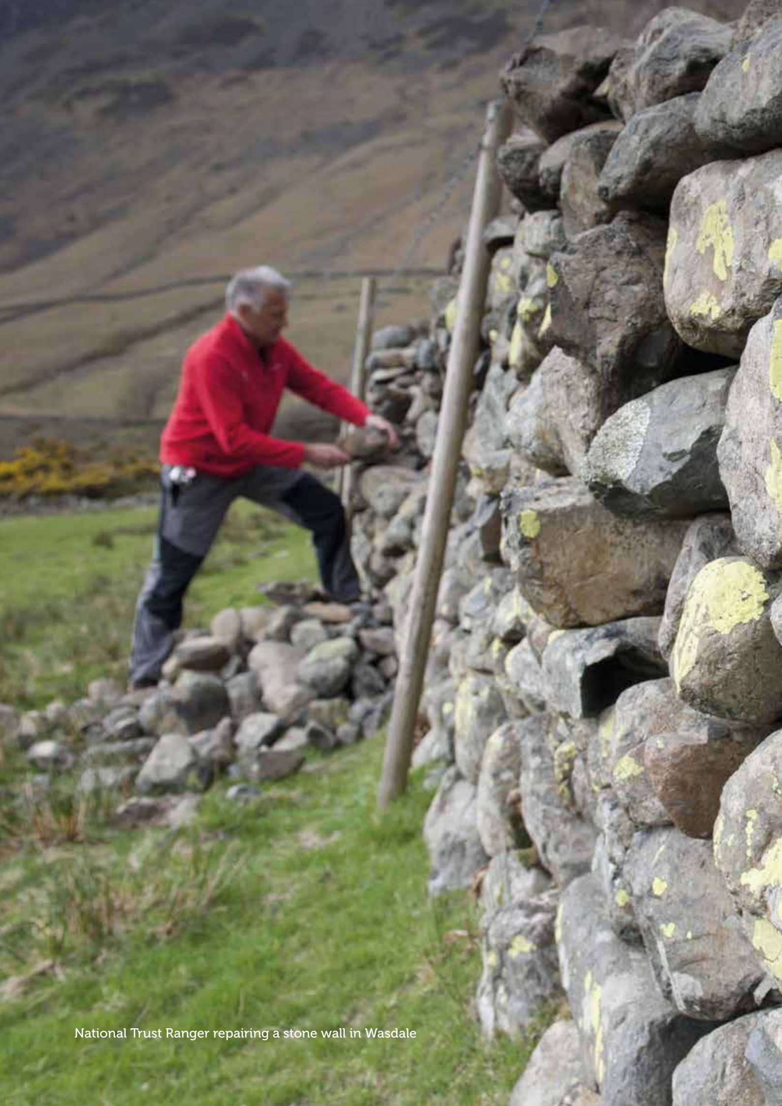
National Trust Ranger repairing a stone wall in Wasdale