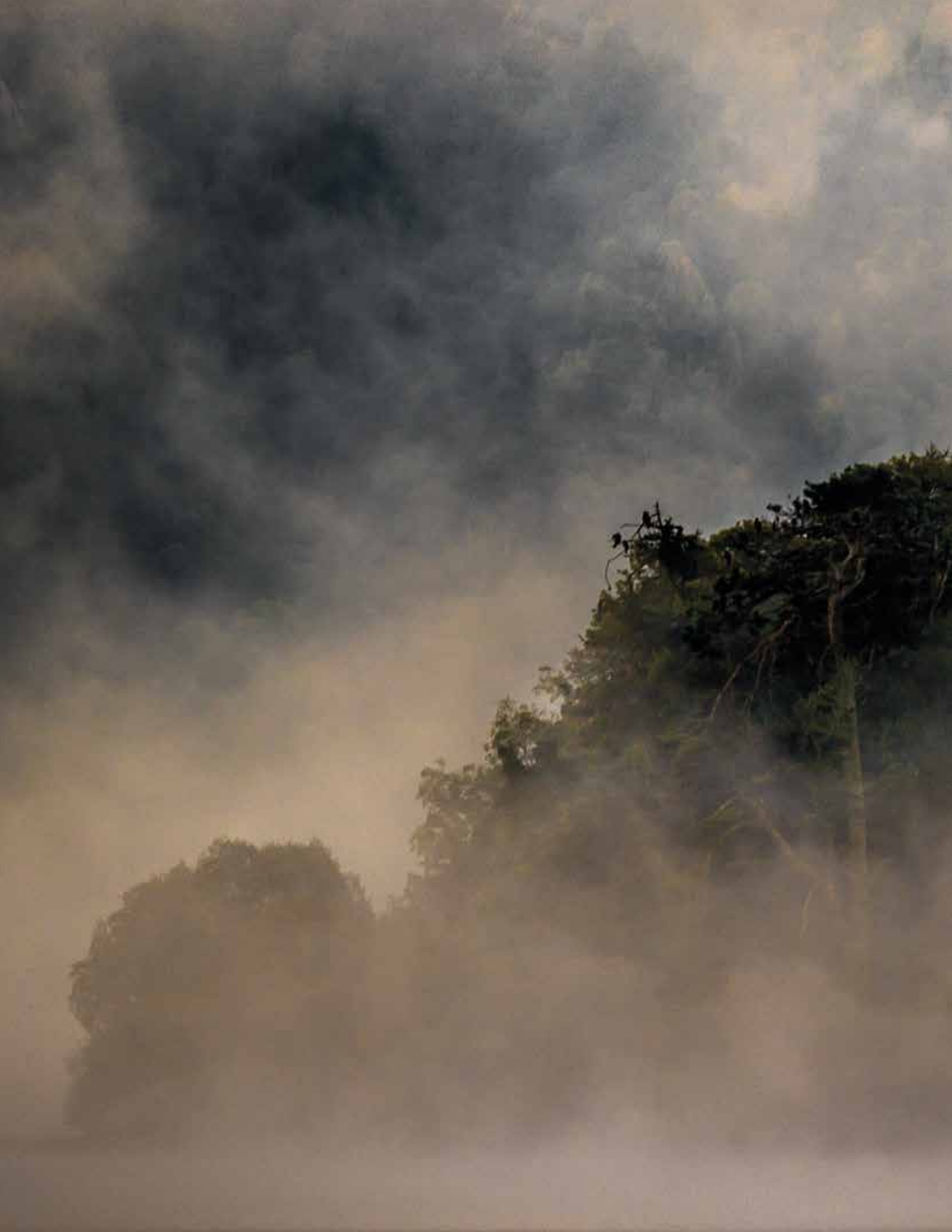
View of Rampsholme Island from Friar's Crag, Derwent Water