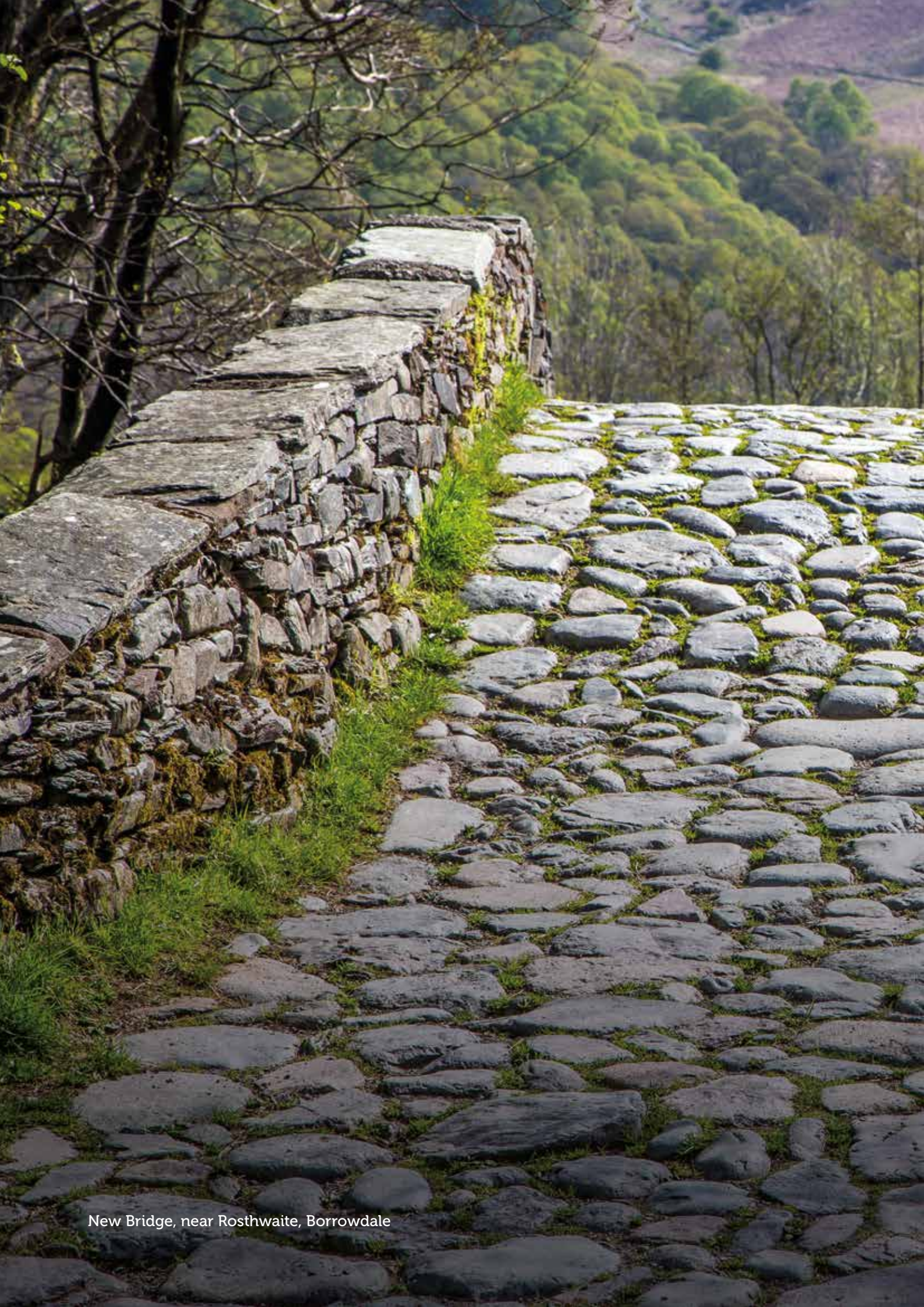
New Bridge, near Rosthwaite, Borrowdale