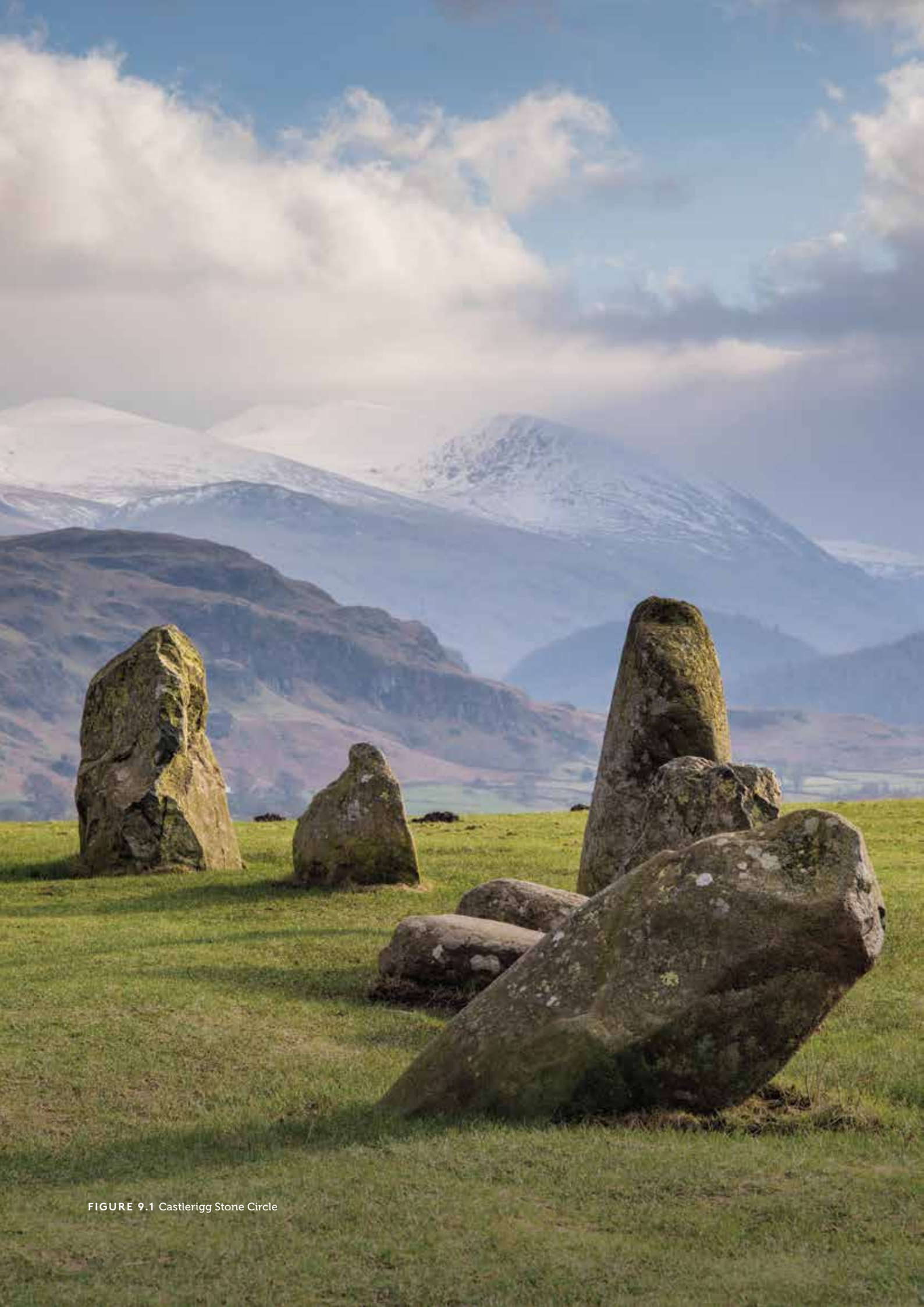
FIGURE 9.1 Castlerigg Stone Circle