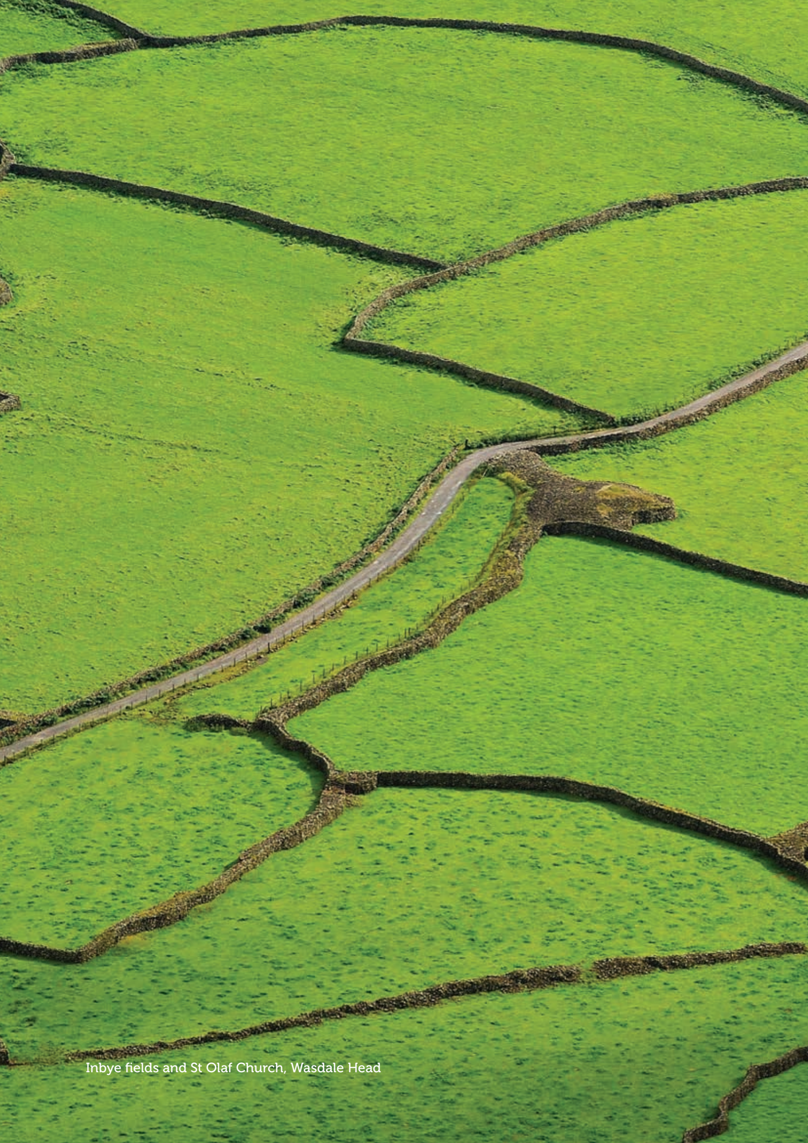
Inbye fields and St Olaf Church, Wasdale Head