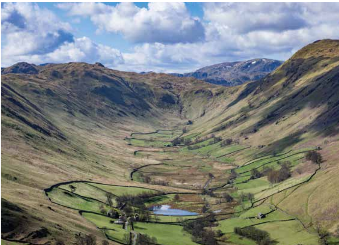
FIGURE 3.5 Boredale is a small side-valley south of the main Ullswater valley, showing a typical Lakeland field pattern of stone-walled inbye fields in the valley bottom, intake fields on the valley slopes and open fell grazing on the fell tops. There was a deer park here in the medieval period and red deer still roam the fells of this part of the Lake District.

The proposed area for the World Heritage Site is coterminous with the National Park boundary and is of adequate size to ensure the complete presentation of the processes and features which convey its significance. It demonstrates all of the elements of a unique fusion of traditional agro-pastoralism, later landscape enhancement, a tradition of tourism and outdoor activity, artistic activities and the manifestations of the conservation movement that developed to protect the Lake District. The relevant tangible and intangible attributes demonstrating Outstanding Universal Value are demonstrably whole and complete with regard to nomination under Criteria (ii), (v) and (vi).