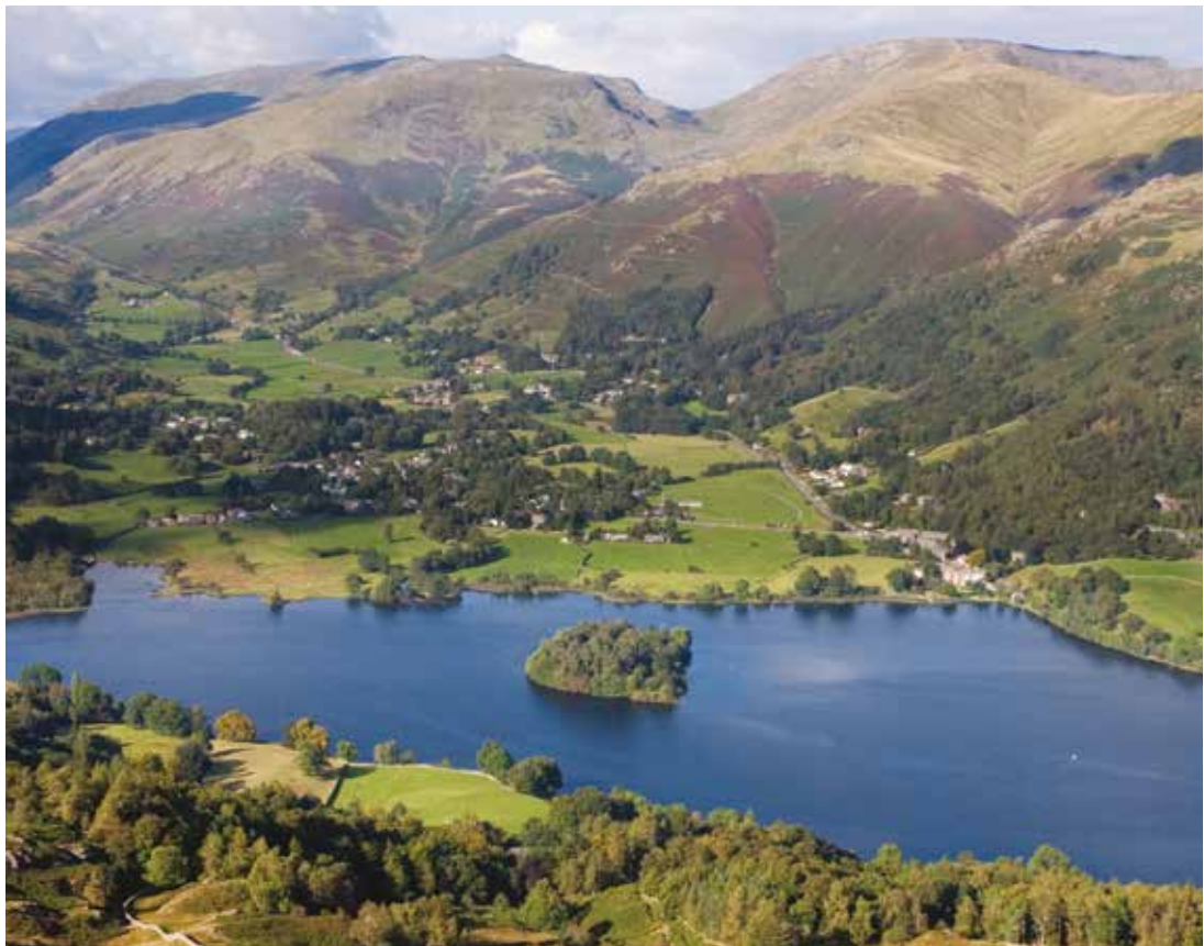
FIGURE 3.1 The Grasmere Valley looking north from Loughrigg Fell. This is one of the iconic views of scenic landscape beauty which were identified and celebrated in the 18th and 19th centuries. The character of the Grasmere Valley is underpinned by agro-pastoral farming and it has been modified in the 18th and 19th centuries by Picturesque gardens and landscaping. The Lake District office of the National Trust is located here and large parts of the valley are owned and protected by the Trust.

It is a compact and distinctive area in which modest but dramatic mountain scenery is divided by a number of steep-sided narrow valleys radiating from the centre of the region, many containing long lakes. Within its overall unity of character, it is a diverse landscape full of contrasts, with a testing climate with high rainfall. Each valley has a distinct character resulting from variations in geology, natural vegetation and its history of human land use. Each valley therefore makes its own particular contribution to the Outstanding Universal Value of the Lake District (see Section 2.c and Volume 2). Figure 3.12 provides a summary of the attributes of Outstanding Universal Value of each valley. Each valley is scored between zero and three for each attribute.