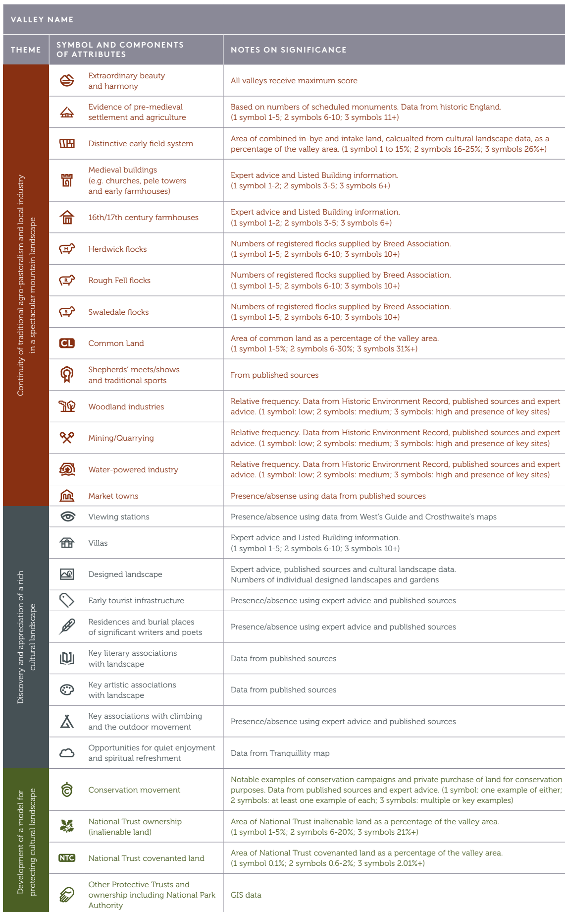
FIGURE 3.13 Criteria for identifying the significance of Valley attributes