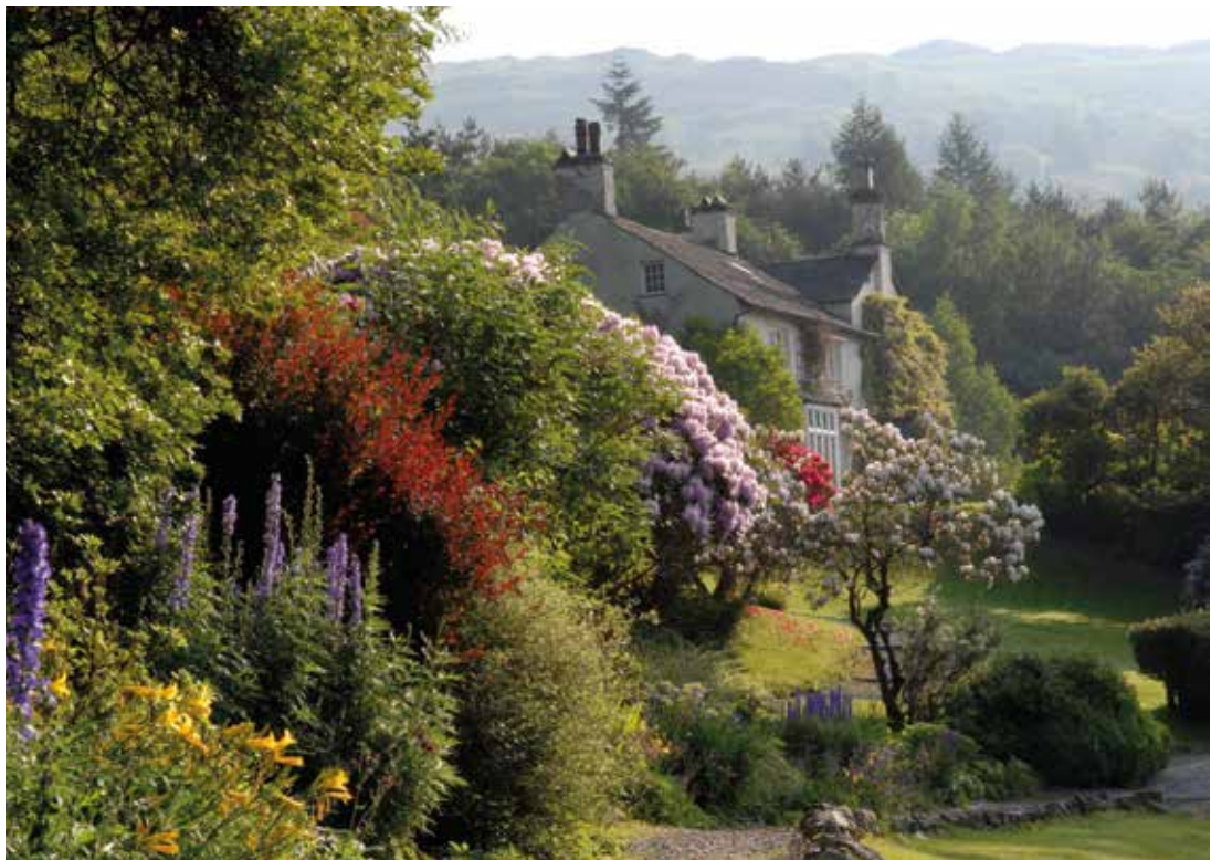
FIGURE 3.6 Rydal Mount and garden. This was the home of William Wordsworth from 1813 to 1850. It was here that he wrote many of his poems and revised and improved much of his earlier works. The property is owned and managed by the Wordsworth family and has been open to the public since 1970.

The English Lake District, like other landscapes, has certainly changed over time. However here, more than in most other places, a special effort has been made to protect the key characteristics of the landscape and to resist unwelcome intrusions.