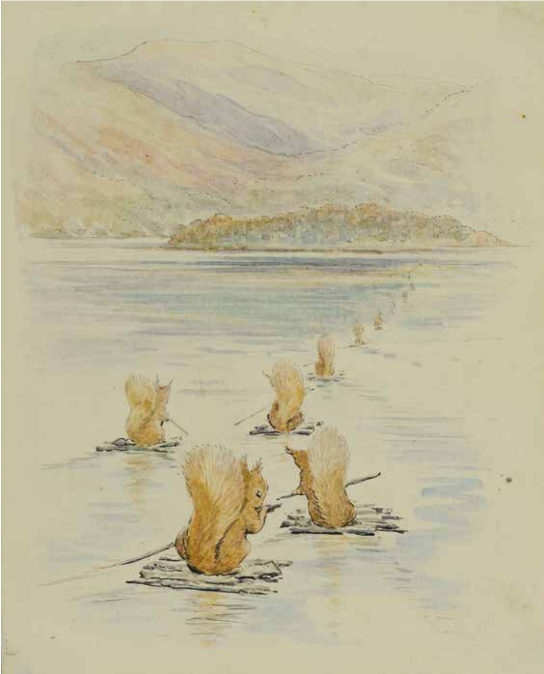
FIGURE 3.9 Watercolour by Beatrix Potter of Squirrel Nutkin sailing to Owl Island (from 'The Tale of Squirrel Nutkin', 1903). Between 1885, when she was 19, and 1907, Beatrix Potter spent nine summer holidays at Lingholm and one at Fawcett Park, the two stately homes whose estates now occupy most of the north western side of Derwent Water. The woods around Lingholm were – and still are – the home of red squirrels and Beatrix sketched them many times in the summer of 1901 while working on the backgrounds for 'The Tale of Squirrel Nutkin' ©Fredrick Warne & Co.2015.

The English Lake District landscape has inspired visitors from the 18th century until the present and its authenticity of spirit and feeling is intimately bound to the Romantic ideas of self-discovery, inner response and the inspiration of cultural landscape that developed in the Lake District. This has resulted in the English Lake District becoming a globally-acknowledged and genuinely inclusive site for outdoor recreation, personal development and spiritual refreshment.