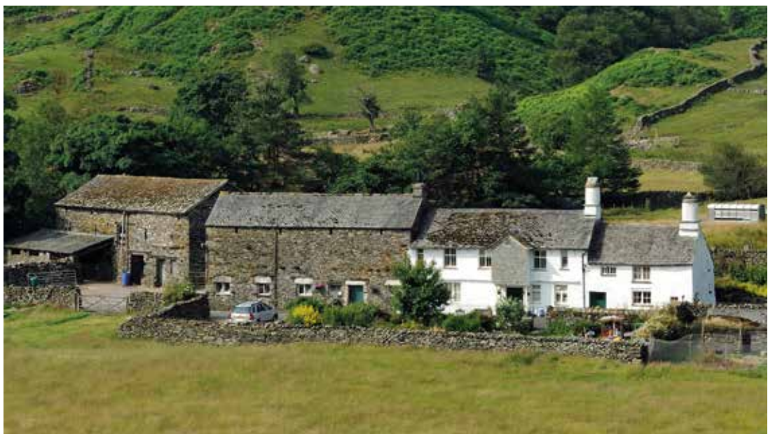
FIGURE 3.7 Fell Foot Farm, Little Langdale, Set at the foot of Wrynose Pass, this substantial early 17th century farmhouse, cruck cottage and barn, was owned in the 18th century by Fletcher Fleming of Rydal and was for a time an inn in the 19th century. It is still one of the key Herdwick farms in the Lake District. A substantial earthwork behind the farm may be the remains of a Norse 'Thing' or meeting mound dating from the 10th century.

The key attributes associated with the development of the model for protecting cultural landscapes including National Trust ownership and covenanted land, ownership by other protective trusts, are potentially vulnerable to economic pressures on the responsible organisations. Other potential threats may come from renewed pressure