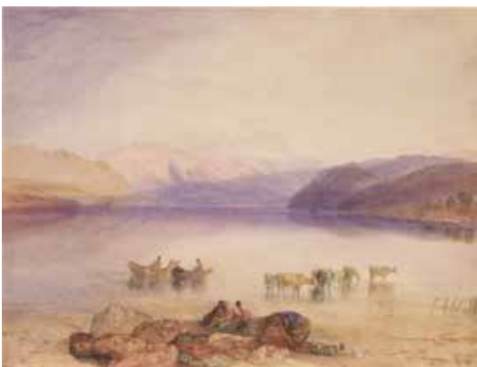
FIGURE 3.4 'Ullswater, Cumberland' by J. M. W. Turner (c. 1835). This watercolour was based on sketched made by Turner during visits to the Lake District going back to 1797. The depiction is not very topographically accurate and displays a glowing light and colour influenced by Turner's visits to Italy and Switzerland. John Ruskin enthused about this work, "The blocks of stone which form the foreground of the Ulleswater [sic] are, I believe, the finest example in the world of the finished drawing of rocks which have been subjected to violent aqueous action." In 2005 the painting was bought by the Wordsworth Trust for £300,000 with help from the National Heritage Memorial Fund and other donors.

This became reality through the National Parks and Access to the Countryside Act 1949, and the designation of the Lake District as a national park in 1951. Although there are, of course, earlier examples of national parks internationally, the UK parks were the first complex, inhabited cultural landscapes. In addition, the comprehensive national system of protected landscapes established through the 1949 Act in the UK was the first of its kind in any country and was based on a nationwide assessment of potential areas for national park designation. The international significance of the category of protected cultural landscape represented by the Lake District was underlined through the adoption by International Union for Conservation of Nature (IUCN) of the Lake District Declaration (1987) which reinforced the importance within IUCN of its Category V Protected Areas (known as Protected Landscapes or Seascapes). This approach to conservation is now widely promoted by IUCN and adopted in many parts of the world, both complementing other stricter forms of nature protection and recognising the importance of cultural influences in landscapes that are rich in natural values.