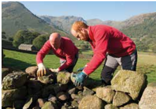
FIGURE 3.10 National Trust staff repairing a stone wall near Hartsop in the Ullswater valley. Stone walling is a traditional skill much prized by farmers and necessary in order to maintain the functionality of the agro-pastoral landscape.

The Lake District National Park Partnership has adopted the bid for World Heritage nomination. This provides long-term assurance of management through a World Heritage Forum (formally a sub-group of the Partnership). The National Park Authority has created a post of World Heritage Co-ordinator and will manage and monitor implementation of the Management Plan on behalf of the Partnership. The Management Plan will be reviewed every five years. A communications plan has been developed in order to inform residents and visitors of the World Heritage bid and this will be developed and extended if the site is inscribed. The Management Plan seeks to address the long term challenges faced by the property including threats faced by climate change, development pressures, changing agricultural practices and diseases, and tourism.