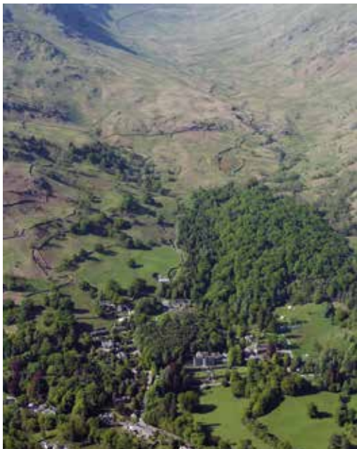
FIGURE 3.8 Rydal Hall and park from the air. The area of the former medieval deer park can be seen beyond the hall in the upper Rydal valley. The Picturesque parkland surrounding Rydal Hall was developed by Sir Daniel Fleming in the mid-17th century and in 1909 the famous landscape gardener, Thomas Mawson, added a formal garden on the south side of the hall.

As an evolving cultural landscape, the English Lake District conveys its Outstanding Universal Value not only through individual attributes but also in the pattern of their distribution amongst the 13 constituent valleys and their combination to produce an over-arching pattern and system of land use. The key attributes relate to a unique natural landscape which has been shaped by a distinctive and persistent system of agro-pastoral agriculture and local industry with the later overlay of distinguished villas, gardens and formal landscapes influenced by the Picturesque movements; the resulting harmonious beauty of the landscape; the stimulus of the English Lake District for artistic creativity and globally-influential ideas about landscape; the early origins and ongoing influence of the tourist industry and outdoor movement; and the physical legacy of the conservation movement that developed to protect the English Lake District.