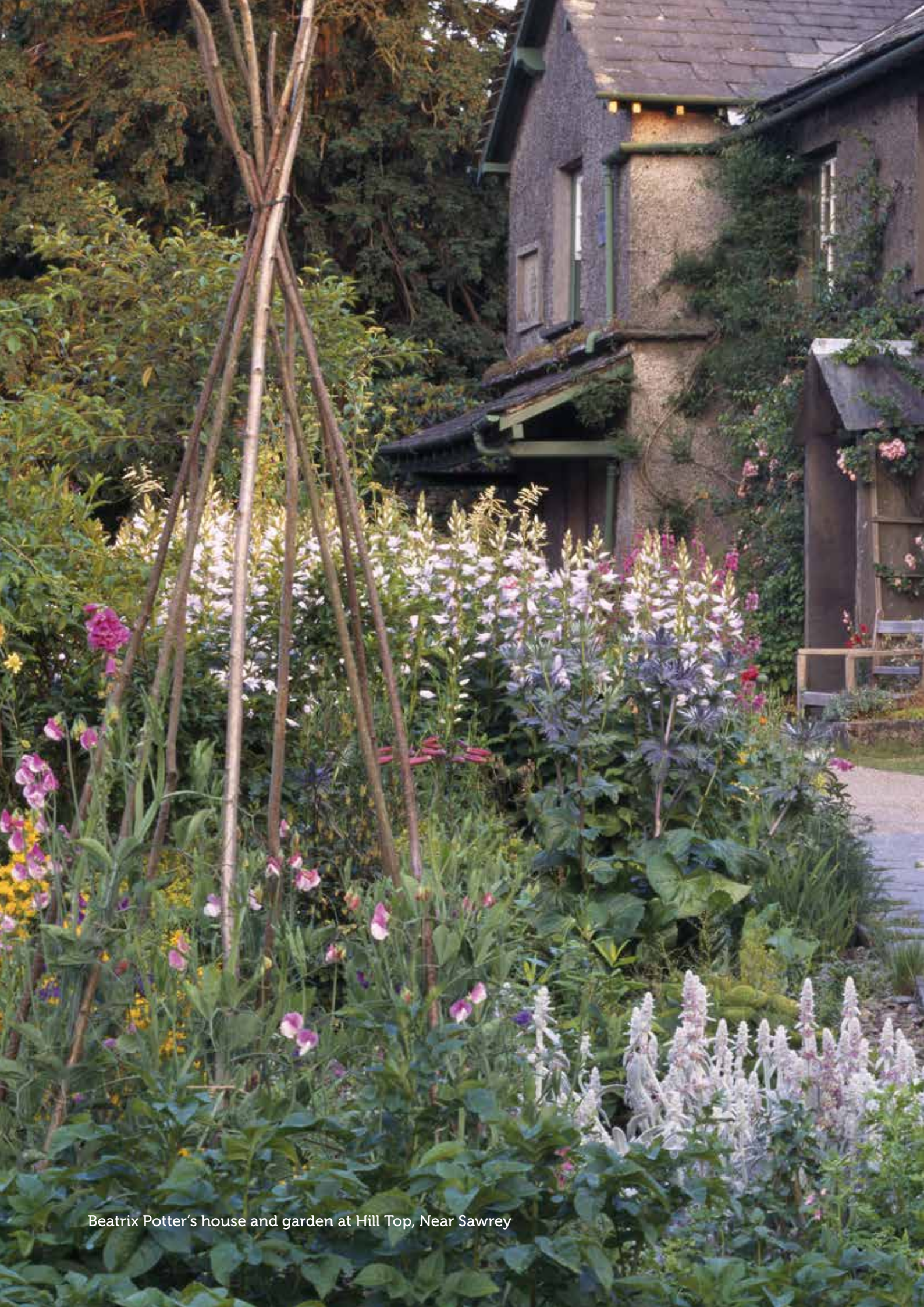
Beatrix Potter's house and garden at Hill Top, Near Sawrey