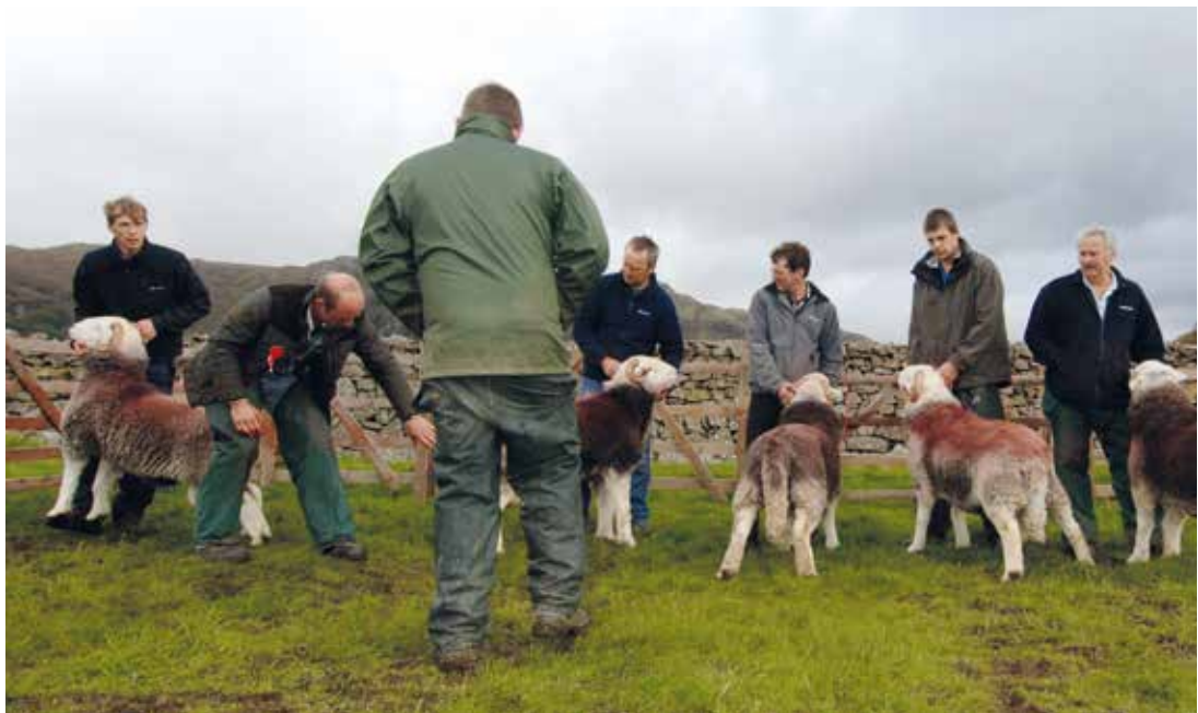
FIGURE 3.3 Judging of Herdwick tups at the Eskdale show. Eskdale hosts the premier annual Herdwick show on the last Saturday in September and the Herdwick Tup show in May, each year. The competition between Herdwick farmers to produce high quality tups is an important part of maintaining the health and survival of this native Lake District breed.

The English Lake District's spectacular lake and mountain scenery and traditional farming, was 'discovered' as a place of sublime and picturesque beauty in the mid-18th century and quickly became the focus for visits by the English educated classes. William Gilpin elaborated a self-conscious idea of landscape which challenged visitors to 'appreciate it' in particular ways which were different to the European aesthetics which had stimulated the initial interest.