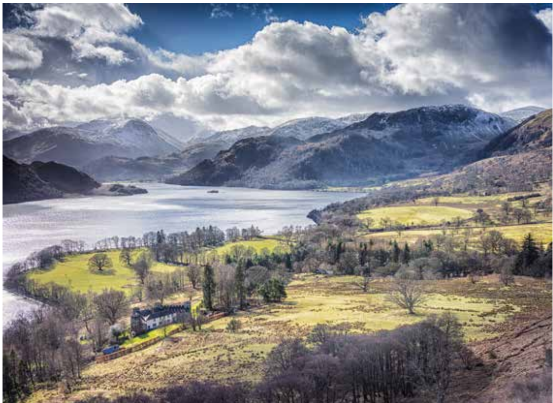
FIGURE 3.14 View of Ullswater from Gowbarrow Park. This includes the enclosed inbye land of Glencoyne Park, the woodland surrounding the celebrated waterfall at Aira Force and the Gothic hunting lodge of Lyulph's Tower (centre left), built in 1780 for the Earl of Surrey and one of the earliest Picturesque houses in the Lake District. The daffodils in the Glencoyne woodlands inspired Wordsworth's poem 'I wandered lonely as a cloud' and large parts of this landscape are owned and managed by the National Trust.

The Lake District National Park Partnership has adopted the bid for World Heritage nomination. This provides long-term assurance of management through a World Heritage Forum (formally a sub-group of the Partnership). The National Park Authority has created a post of World Heritage Coordinator and will manage and monitor implementation of the Management Plan on behalf of the Partnership. The Management Plan will be reviewed every five years. A communications plan has been developed in order to inform residents and visitors of the World Heritage bid and this will be developed and extended if the site is inscribed. The Management Plan seeks to address the long term challenges faced by the property including threats faced by climate change, development pressures, changing agricultural practices and diseases, and tourism.