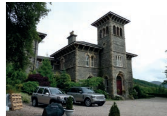
NO. 10 Underscar Manor