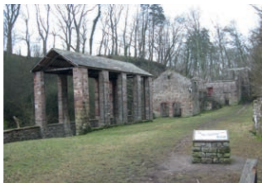
NO. 7 The Howk bobbin mill (managed by National Park Authority)