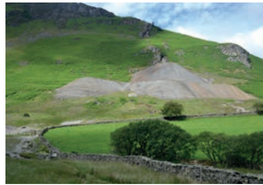
NO. 4 Goldscope Mine (owned by National Trust)