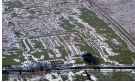
NO. 1 Roman Fort at Troutbeck

EXAMPLES OF KEY ATTRIBUTES: As shown on the Borrowdale and Bassenthwaite North Valley illustrative map