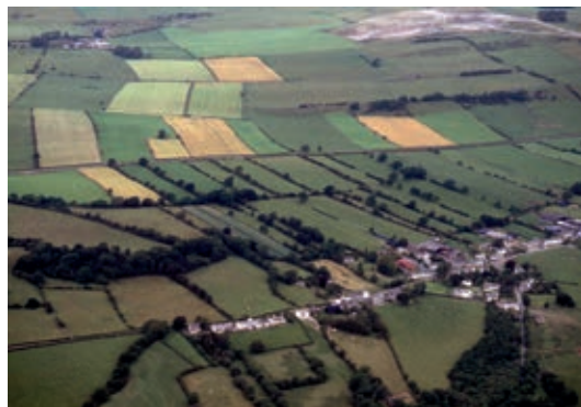
NO. 5 Blindcrake field system