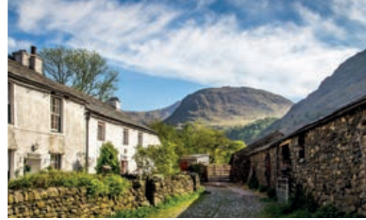
NO. 2 Seathwaite Farm (owned by National Trust)