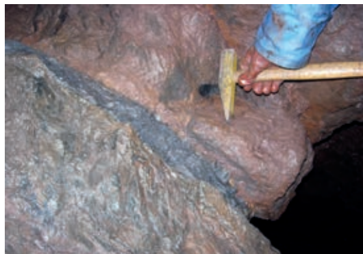
NO. 5 Seathwaite Wad Mine (owned by National Trust)