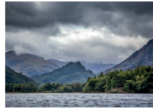
NO. 10 Jaws of Borrowdale