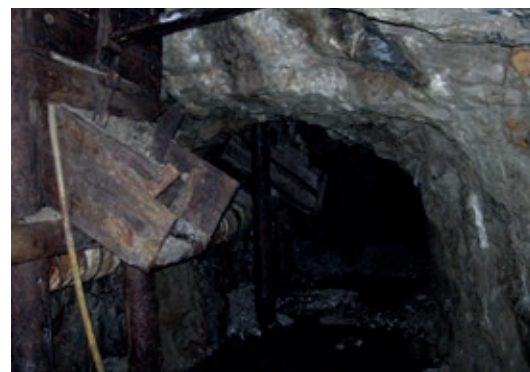
NO. 8 Carrock Mine