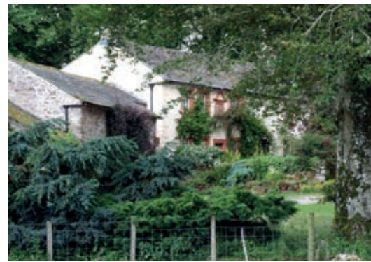
NO. 4 Browning Farm