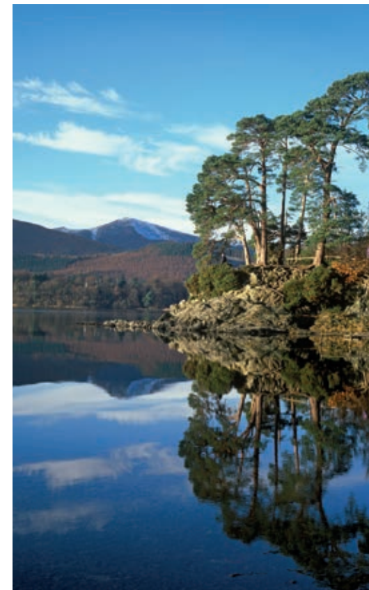
NO. 11 Friars Crag (owned by National Trust)