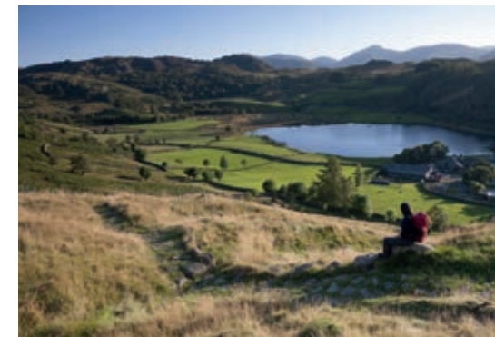
NO. 12 Watendlath (owned by National Trust)