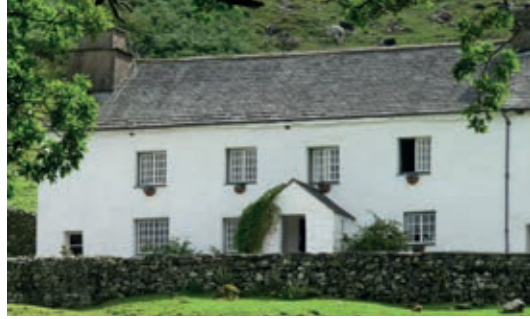
NO. 1 Ashness Farm (owned by National Trust)

EXAMPLES OF KEY ATTRIBUTES: As shown on the Borrowdale and Bassenthwaite South Valley illustrative map