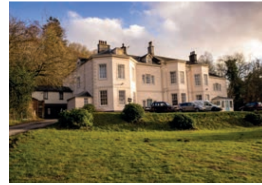
NO. 8 Barrow House