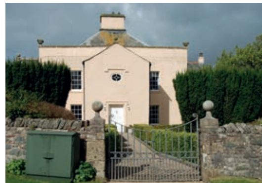
NO. 6 Hesketh Hall