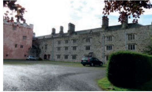
NO. 2 Isele Hall