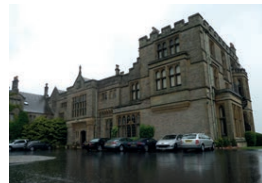
NO. 11 Armathwaite Hall