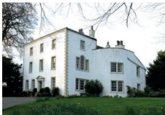
NO. 6 Greta Hall