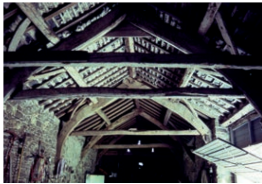
NO. 3 Routenbeck cruck barn