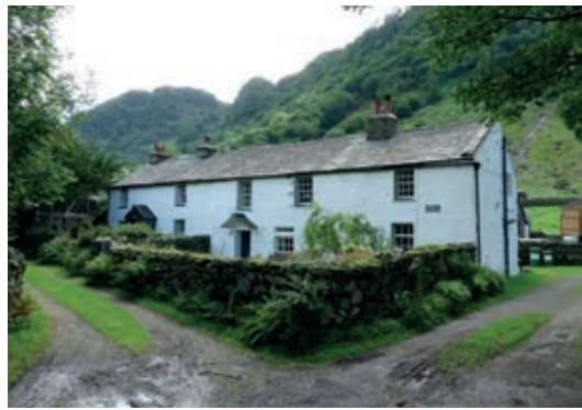
NO. 3 Croft Farm (owned by National Trust)