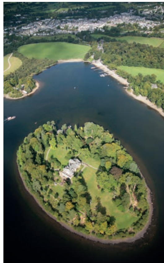
NO. 7 Derwent Isle (owned by National Trust)