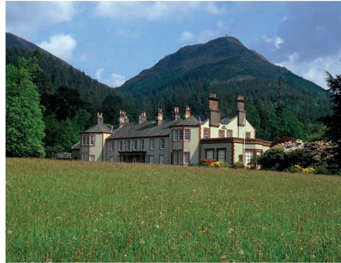
NO. 9 Mirehouse