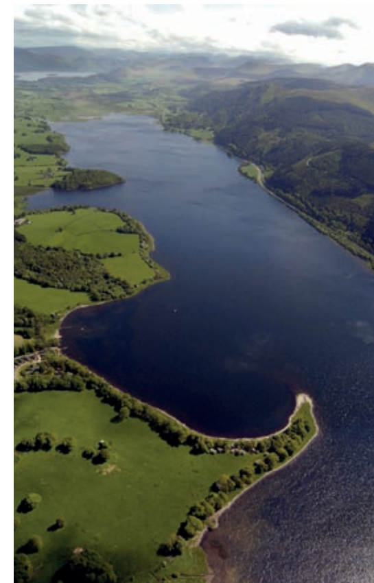
NO. 12 Bassenthwaite Lake (owned and managed by National Park Authority)