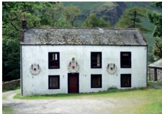
NO. 5 Gatesgarth Farm