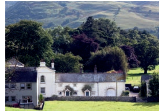
NO. 9 Lorton Park