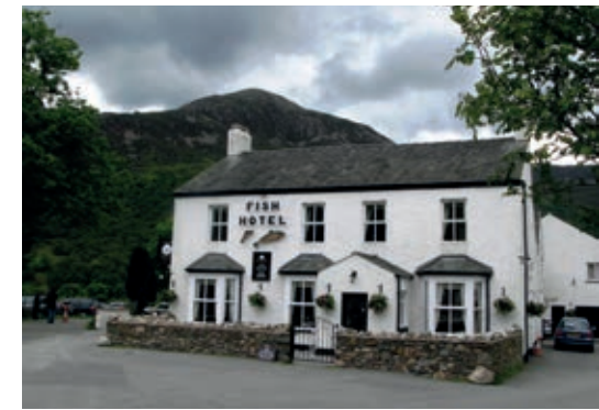
NO. 10 The Fish Inn, Buttermere