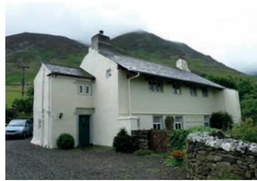
NO. 6 Low Hollins Farm