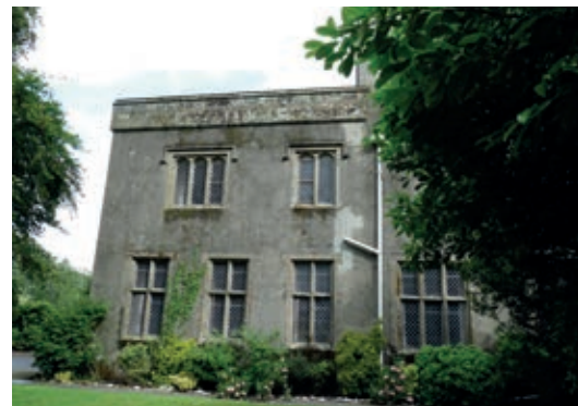
NO. 6 Lorton Hall