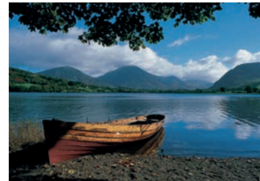
NO. 11 Loweswater