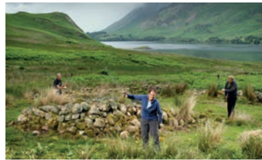
NO. 2 Scales Beck medieval settlement (during bracken clearance)