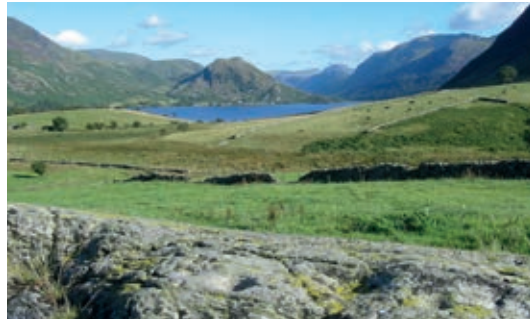
NO. 1 Prehistoric rock art at Low Park, Crummock

EXAMPLES OF KEY ATTRIBUTES: As shown on the Buttermere illustrative map