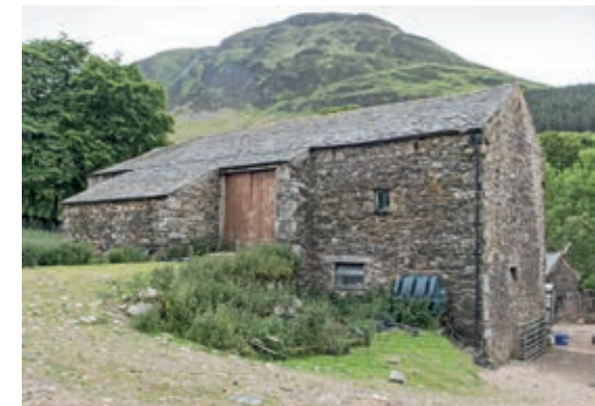
NO. 12 High Nook Farm