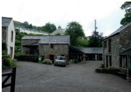
NO. 7 Wythop Mill