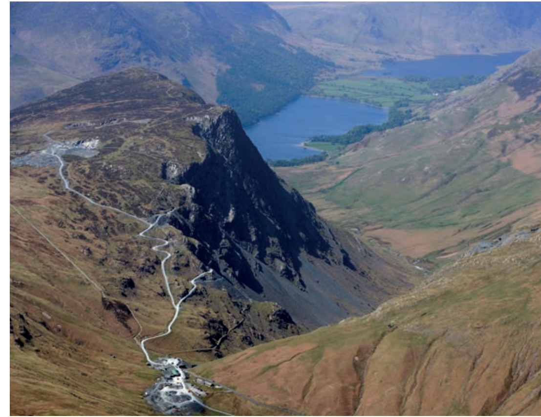
NO. 8 Honister Slate Quarry