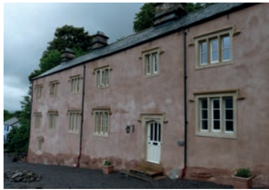
NO. 3 High Hollins Farm