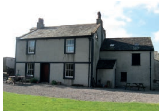
NO. 5 Longmoor Head