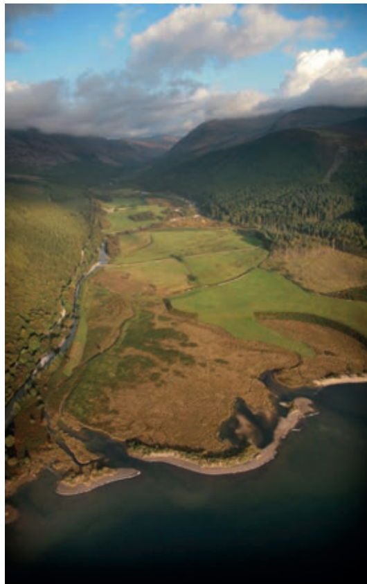
NO. 4 Gillerthwaite – site of medieval vaccary