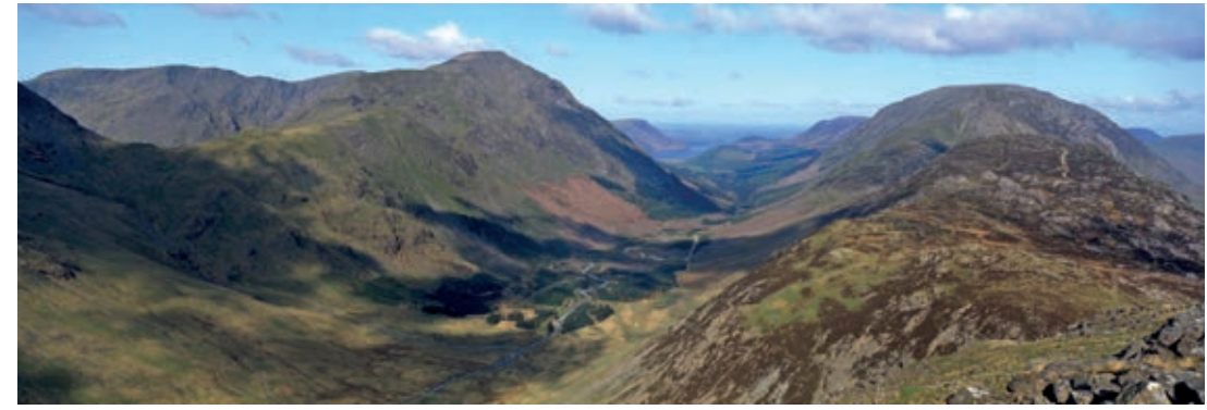
NO. 7 Ennerdale forestry plantations