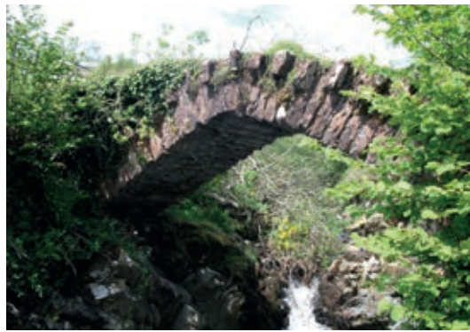
NO. 3 Monks Bridge (owned by National Trust)