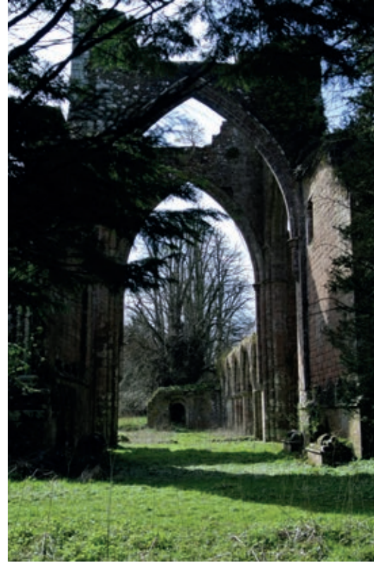
NO. 2 Calder Abbey