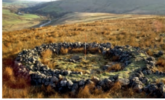
NO. 1 Prehistoric settlement on Town Bank (owned by National Trust)

EXAMPLES OF KEY ATTRIBUTES: As shown on the Ennerdale illustrative map