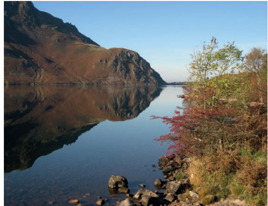
NO. 8 Ennerdale Water