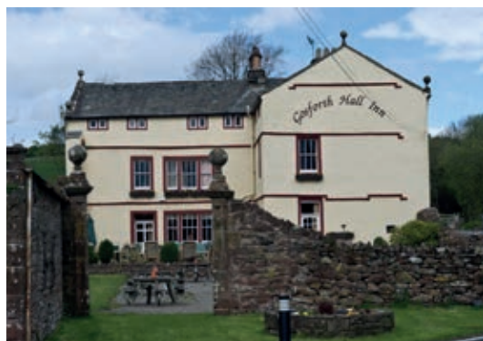
NO. 6 Gosforth Hall