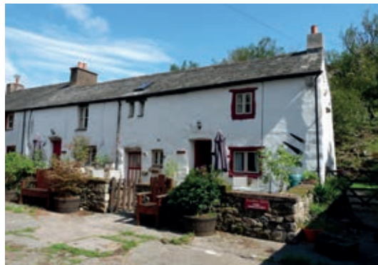
NO. 4 Woodhow Farm