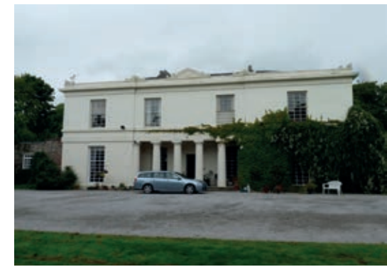
NO. 11 Steelfield Hall