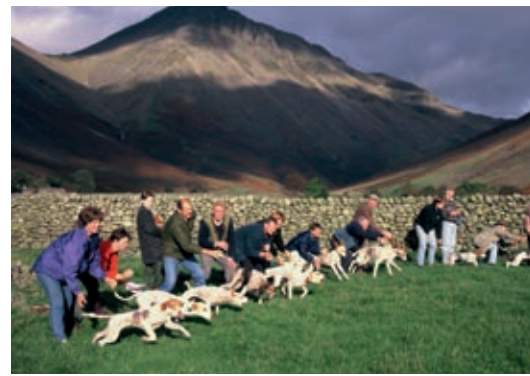
NO. 3 Wasdale Head show