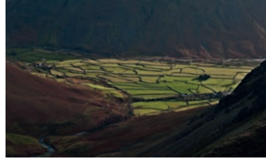
NO. 2 Wasdale field system (owned by National Trust)