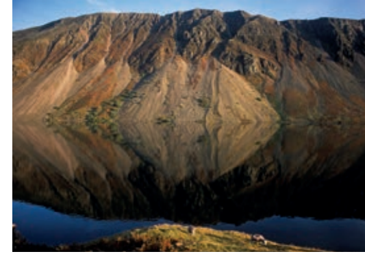
NO. 8 Wast Water and Wasdale Screes (owned by National Trust)