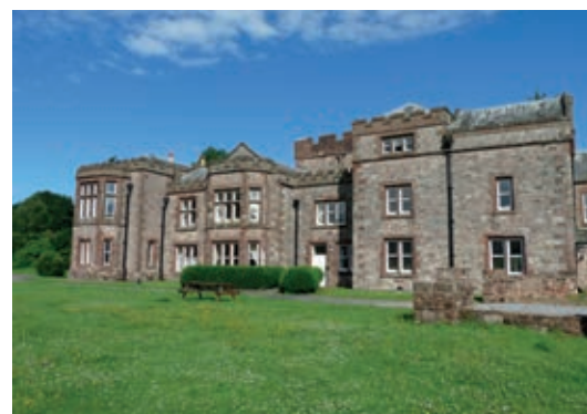
NO. 7 Irton Hall