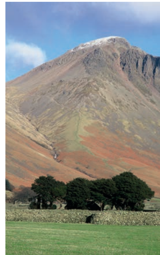
NO. 12 Great Gable (owned by National Trust)