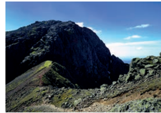
NO. 10 Broad Stand (location of an early rock climb by the poet Samuel Taylor Coleridge)