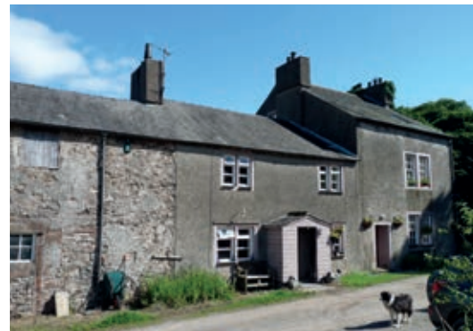
NO. 5 Stangends Farm (owned by National Trust)