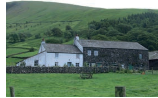
NO. 9 Wasdale Hall