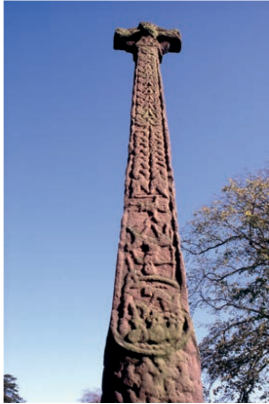
NO. 1 Gosforth Cross (10th century Norse design)

EXAMPLES OF KEY ATTRIBUTES: As shown on the Wasdale illustrative map