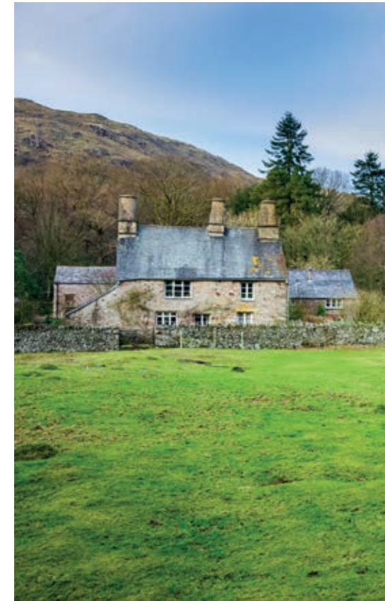
NO. 9 Dalegarth Hall