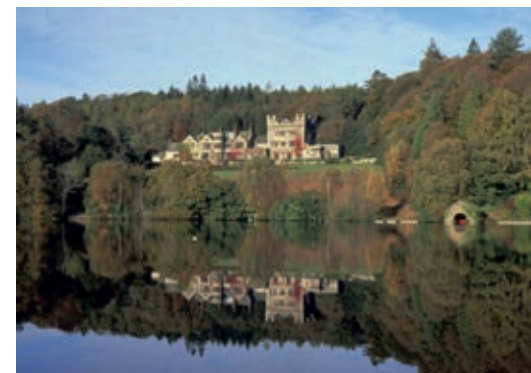
NO. 10 Gatehouse (villa)