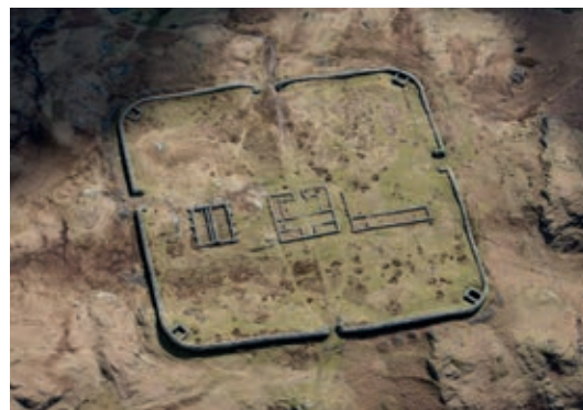
NO. 3 Hardknott Roman fort (owned by National Trust)