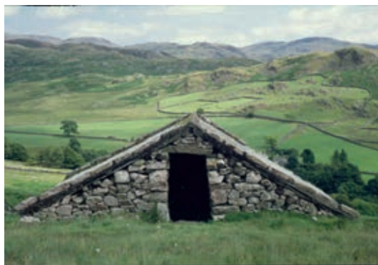
NO. 6 Peat huts above Boot, Eskdale