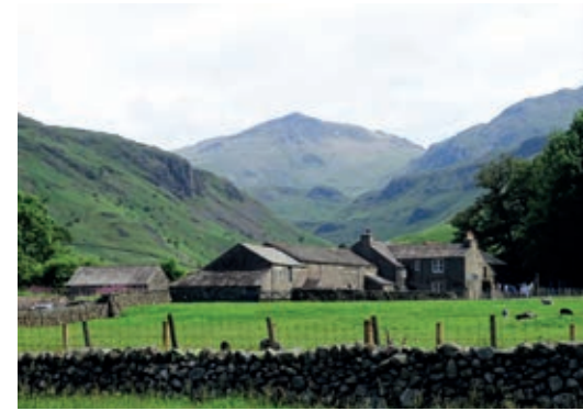
NO. 8 Farm at Brotherikeld (owned by National Trust)