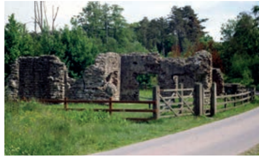
NO. 2 Ravenglass Roman fort and bath house (bath house managed by English Heritage)