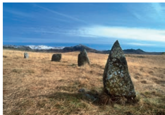
NO. 7 Prehistoric stone circles on Eskdale Moor (owned by National Trust)