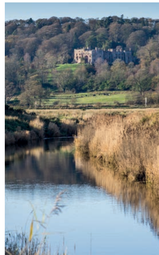
NO. 11 Muncaster Castle and Garden