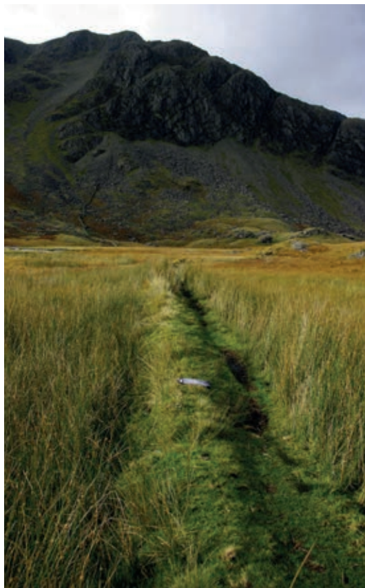
NO. 4 Medieval boundary, Great Moss (owned by National Trust)