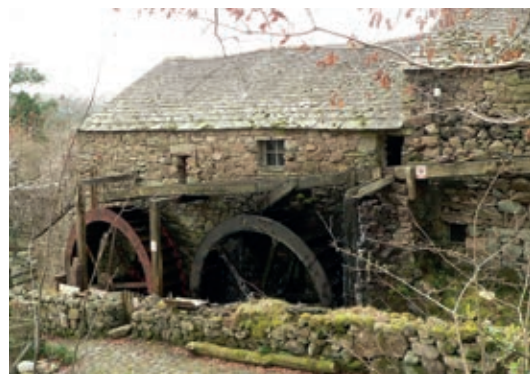
NO. 5 The Eskdale corn mill at Boot (owned by Eskdale Mill and Heritage Trust)