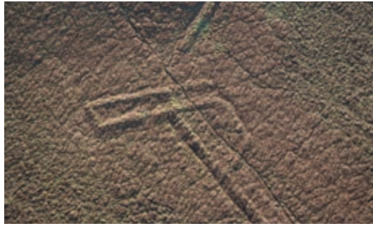
NO. 1 Earthwork remains of medieval farmstead and field system at Great Grassoms