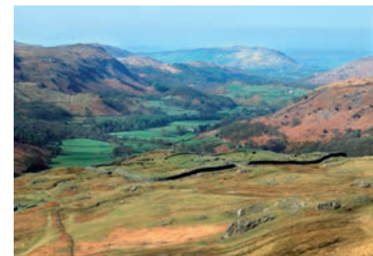
NO. 12 Landscape protected from conifer planting through the 1936 agreement with the Forestry Commission (owned by National Trust)