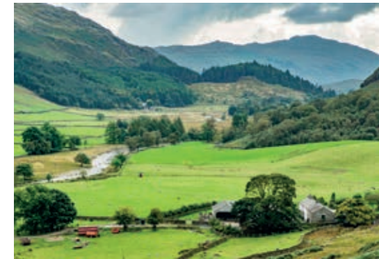
NO. 10 Black Hall Farm (owned by National Trust)