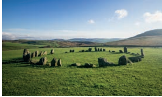
NO. 1 Swinside Stone Circle

EXAMPLES OF KEY ATTRIBUTES: As shown on the Duddon illustrative map