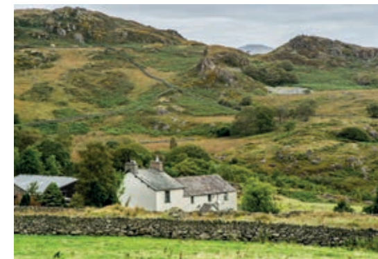
NO. 12 Hazel Head Farm (owned by National Trust)