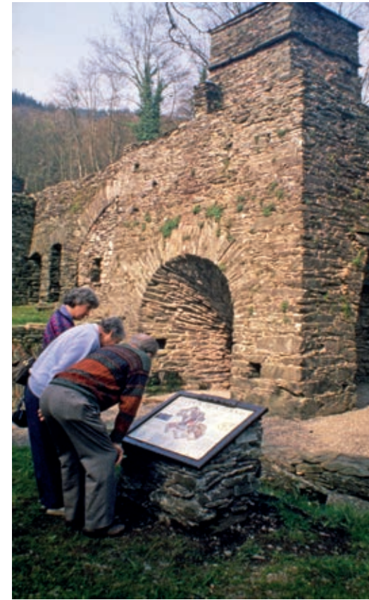
NO. 7 Duddon Furnace (managed by National Park Authority)