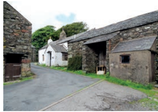
NO. 4 Loganbeck Farm