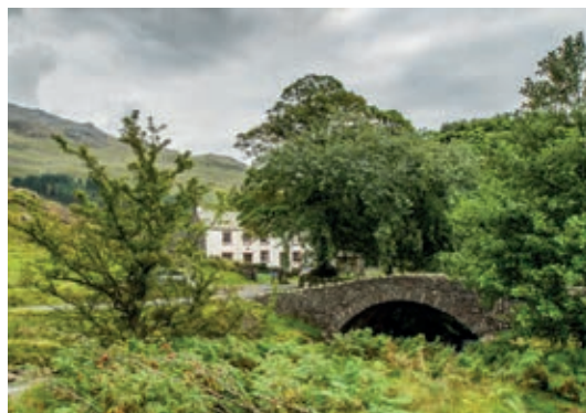
NO. 6 Cockley Beck (owned by the National Trust)