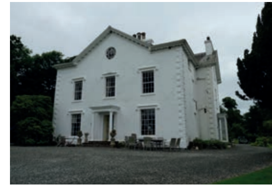
NO. 9 Broadgate (villa)