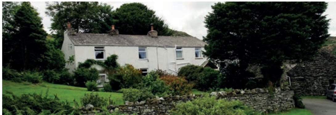
NO. 5 Stephenson Ground