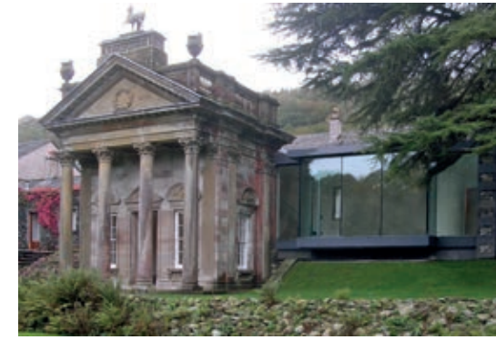
NO. 8 Duddon Hall