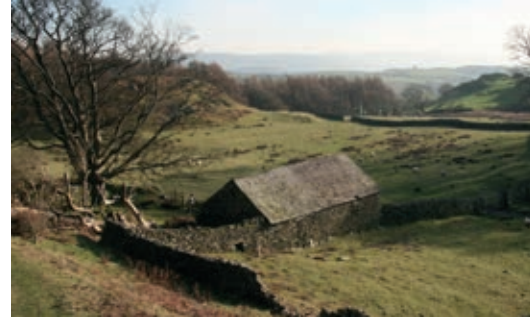
NO. 2 Stickle House Barn