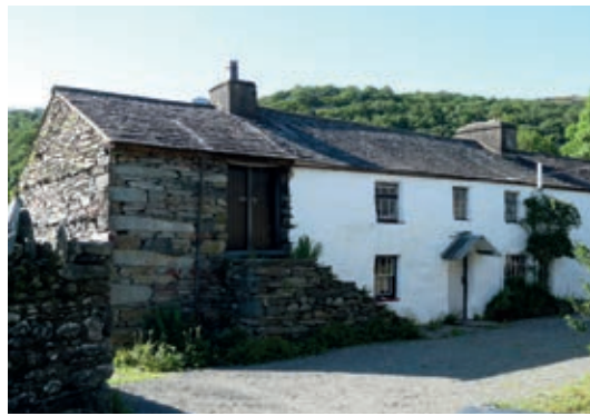
NO. 3 Hall Dunnerdale