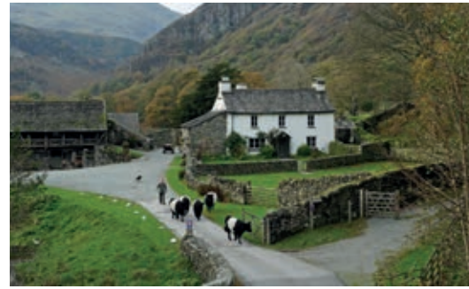
NO. 2 Yew Tree Farm (owned by National Trust)