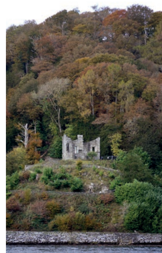
NO. 9 Claife Station (owned by National Trust)