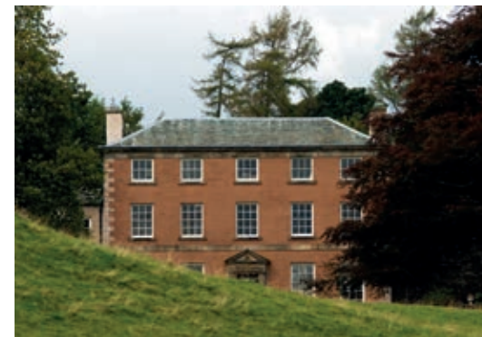
NO. 10 Belmount (villa owned by National Trust)