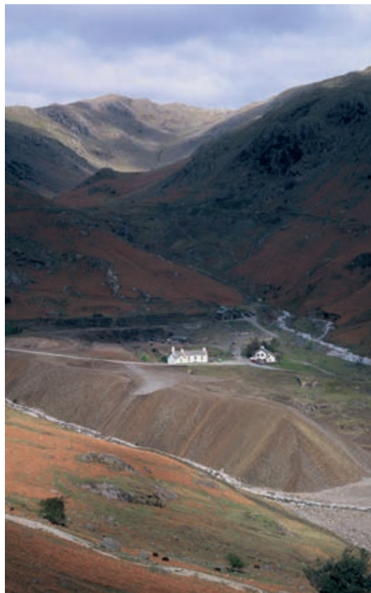
NO. 5 Coniston Copper Mines