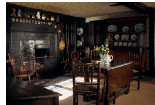
NO. 12 Beatrix Potter's house at Hill Top (owned by National Trust)