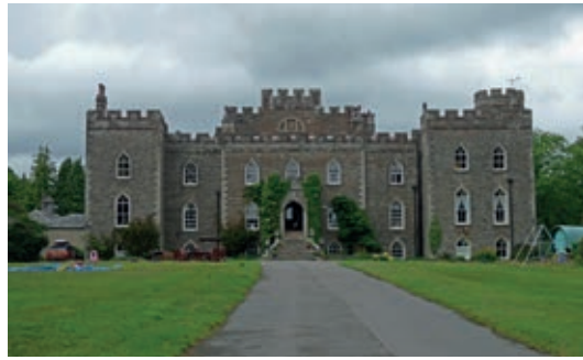
NO. 1 Broughton Tower (began as 14th century pele tower)

EXAMPLES OF KEY ATTRIBUTES: As shown on the Coniston illustrative map