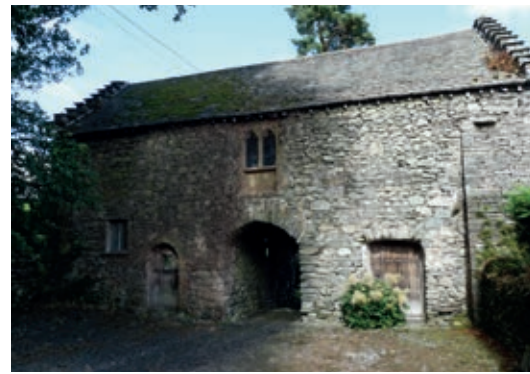
NO. 4 Hawkshead Old Hall and Courthouse (owned by National Trust)