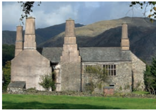
NO. 3 Coniston Hall (owned by National Trust)