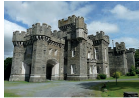
NO. 8 Wray Castle (owned by National Trust)