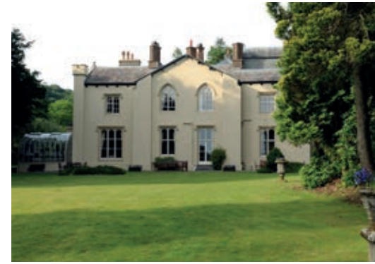
NO. 7 Monk Coniston and Tarn Hows (owned by National Trust)