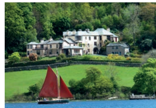
NO. 11 Brantwood (John Ruskin's residence, owned by The Brantwood Trust)