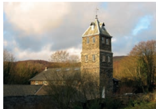
NO. 6 Low Wood Gunpowder Works