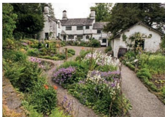
NO. 6 Town End, Troutbeck (owned by National Trust)