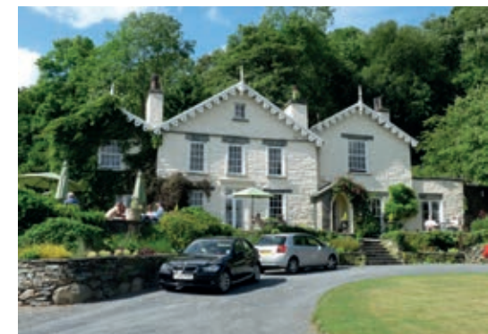
NO. 10 Dove Nest