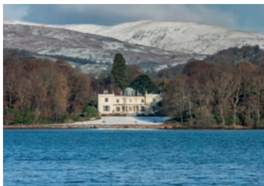
NO. 7 Storrs Hall