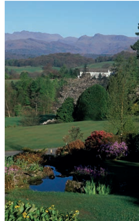
NO. 8 Holehird house and gardens (owned by Holehird Trust)