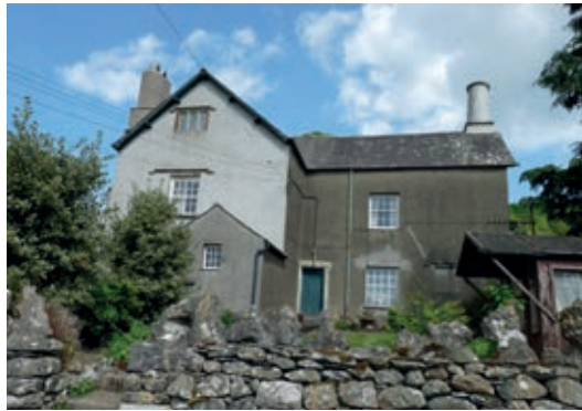
NO. 3 Hampsfield Hall