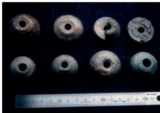
NO. 2 Bryant's Gill early medieval settlement (spindle whorls found during excavation)