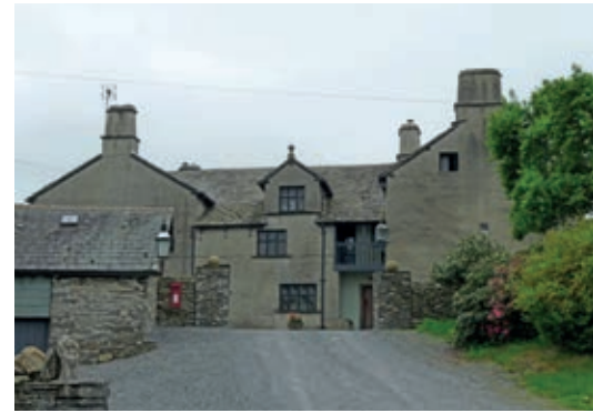
NO. 4 Hodge Hill Hall, Cartmel Fell