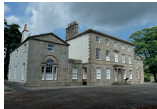
NO. 8 Broughton Lodge