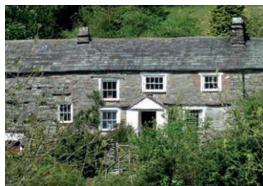
NO. 7 Low Sadghyll