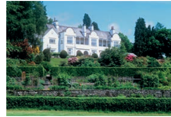
NO. 9 Brockhole (owned by National Park Authority)