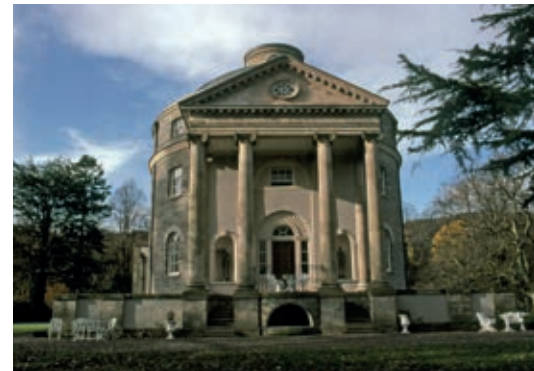
NO. 6 Belle Isle house