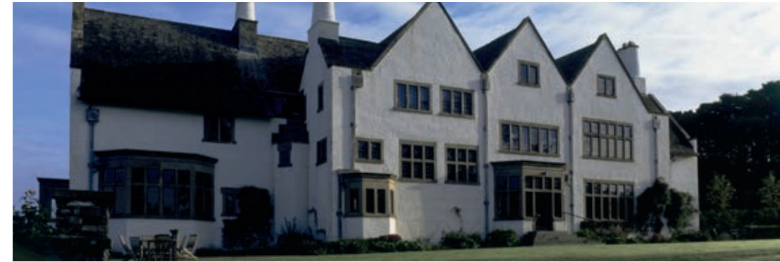
NO. 11 Blackwell (owned by Lakeland Arts)