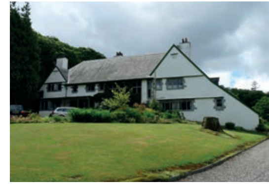
NO. 10 Moor Crag