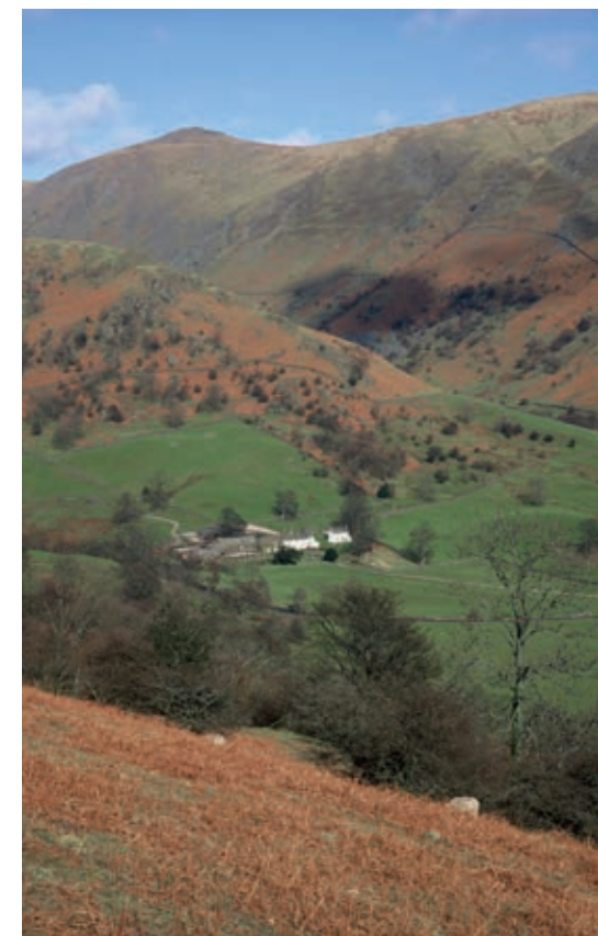
NO. 12 Troutbeck Park (owned by National Trust)