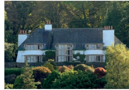
NO. 9 Broad Leys