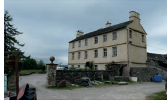
NO. 2 Cowmire Hall