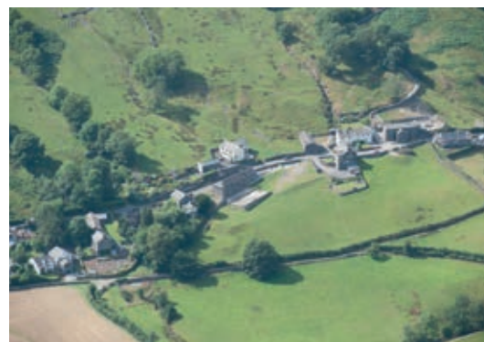
NO. 5 Troutbeck village