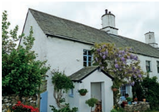
NO. 5 Plumgarths Cottages