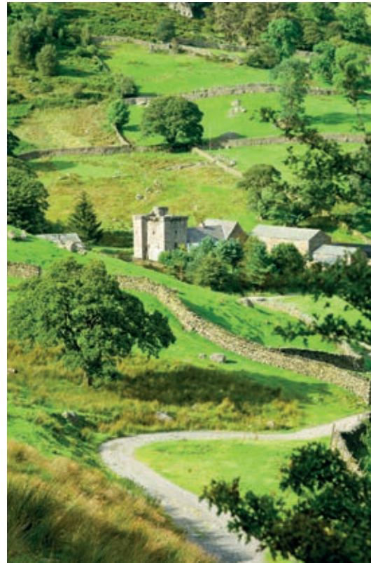
NO. 3 Kentmere Hall (pele tower)