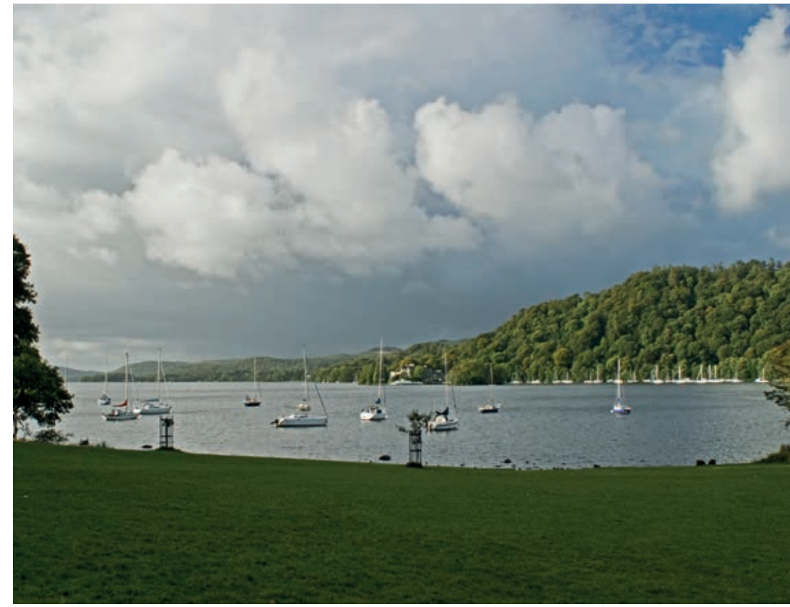
NO. 12 Cockshott Point (owned by National Trust)