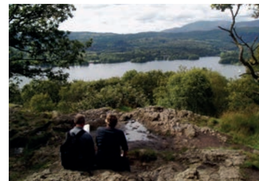
NO. 11 Jenkin Crag viewpoint (owned by National Trust)