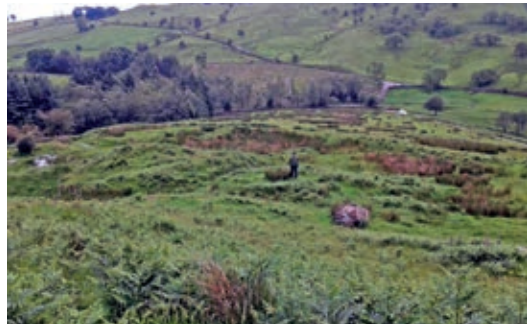
NO. 1 Lamb Pasture Romano- British farmstead

EXAMPLES OF KEY ATTRIBUTES: As shown on the Windermere Valley North illustrative map