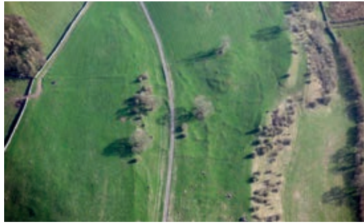
NO. 1 Cunswick Hall Romano-British settlement

EXAMPLES OF KEY ATTRIBUTES: As shown on the Windermere Valley South illustrative map