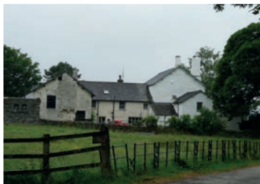
NO. 4 Calgarth Hall