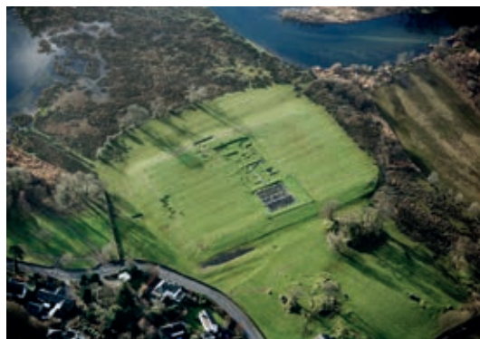
NO. 1 Ambleside Roman Fort (owned by National Trust)