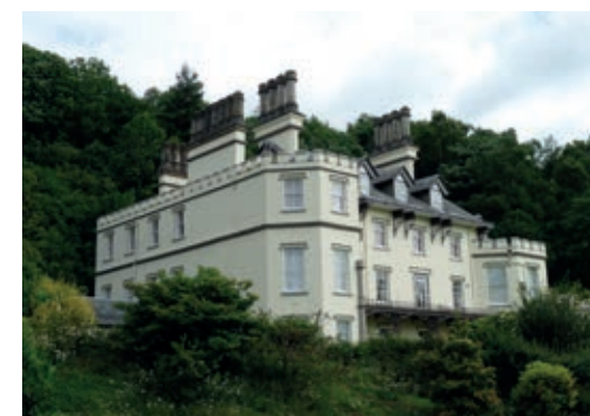
NO. 11 Villas at Clappergate