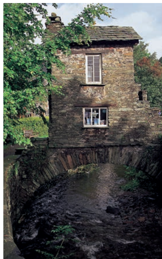
NO. 7 Bridge House, Ambleside (owned by National Trust)