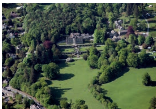
NO. 6 Rydal Park