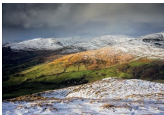
NO. 5 19th century enclosures in Scandale