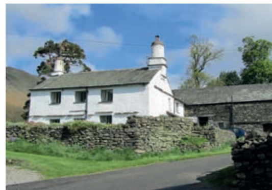
NO. 2 Town Head Farm (owned by National Trust)