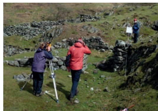
NO. 4 Greenhead Gill Mine (owned by National Trust)