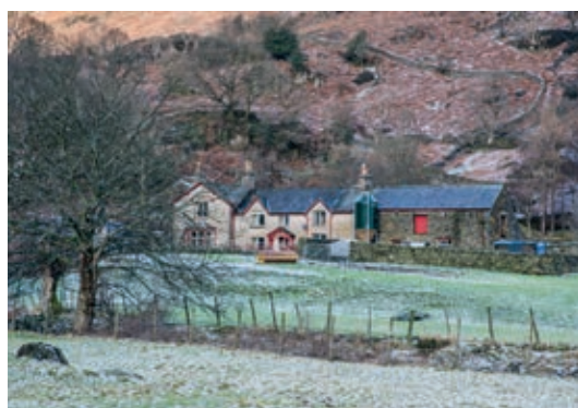
NO. 3 Brimmer Head Farm (owned by National Trust)