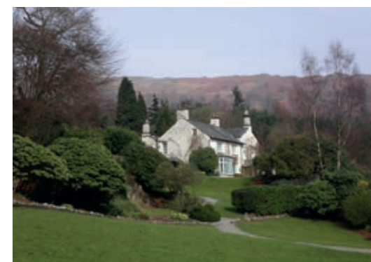
NO. 10 Rydal Mount