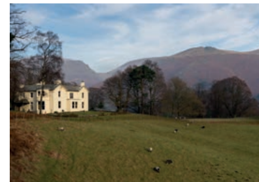
NO. 9 Allen Bank (owned by Wordsworth Trust)