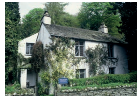
NO. 8 Dove Cottage (owned by Wordsworth Trust)