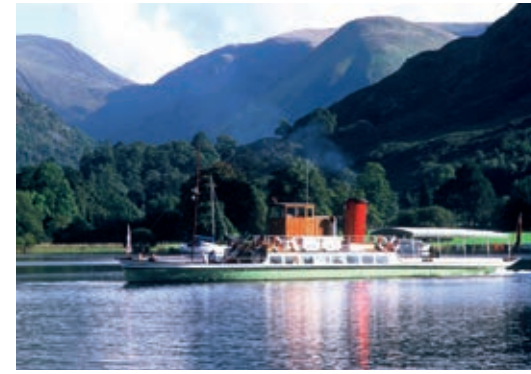
NO. 8 Ullswater Steamers - Lady of the Lake