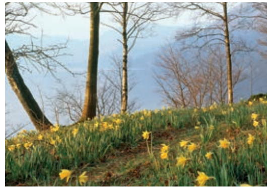
NO. 7 Daffodils near Glencoyne