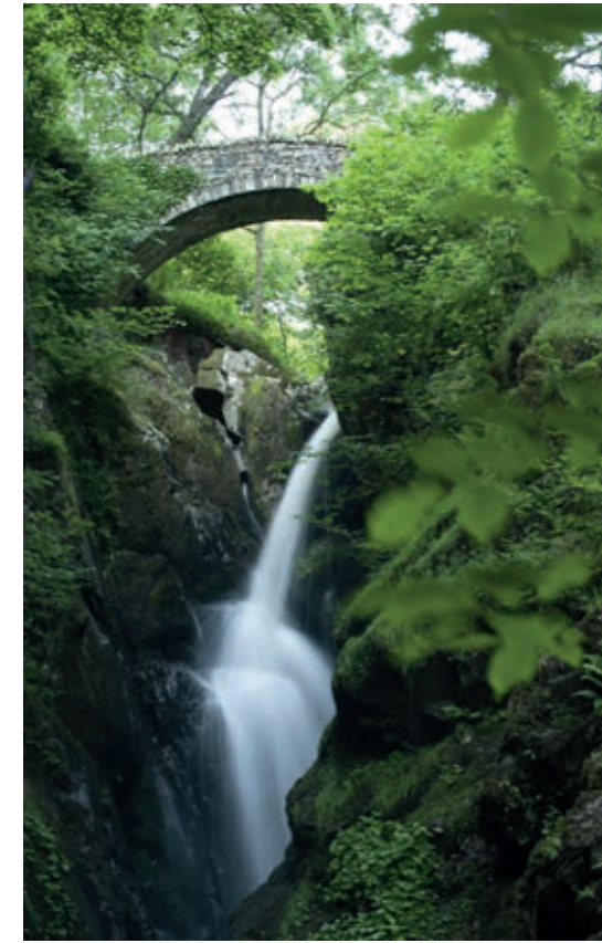
NO. 9 Aira Force (owned by National Trust)