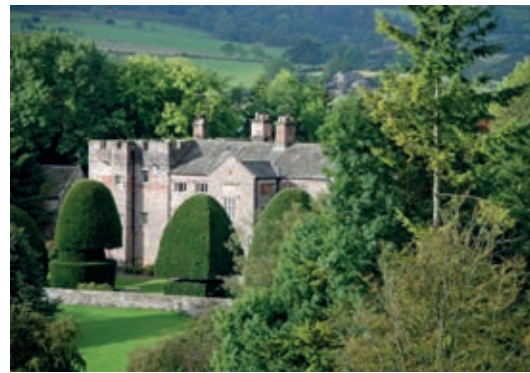
NO. 5 Pele Tower at Hutton John