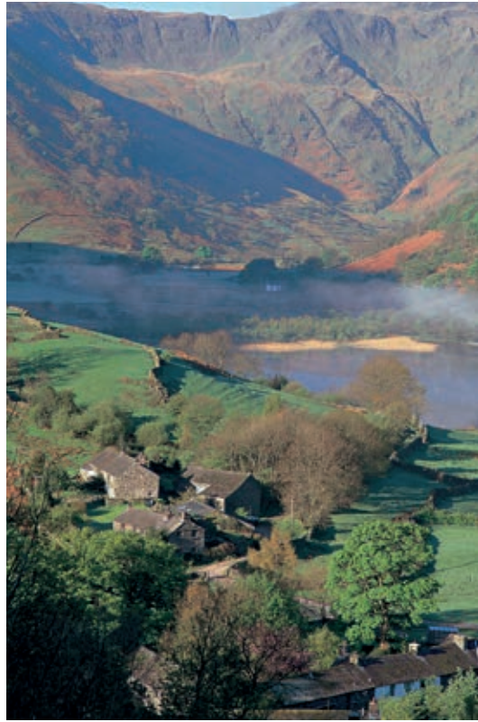
NO. 1 Hartsop Village

EXAMPLES OF KEY ATTRIBUTES: As shown on the Ullswater illustrative map