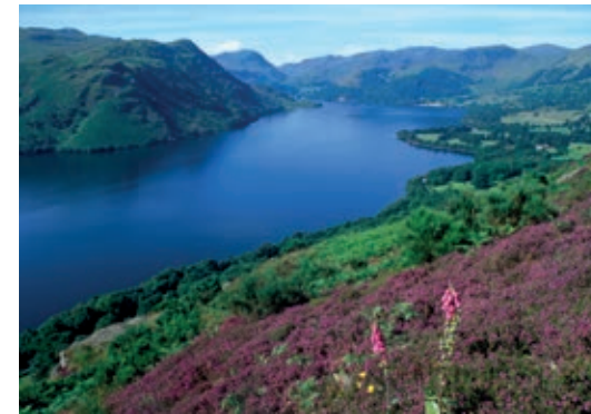
NO. 12 Ullswater