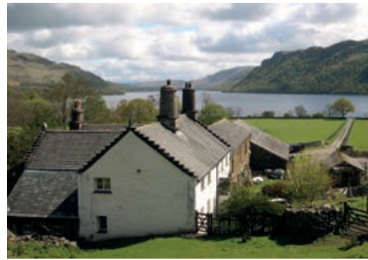
NO. 3 Glencoyne Farm (owned by National Trust)