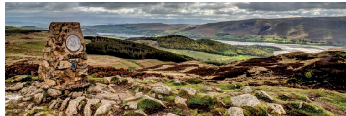
NO. 11 Gowbarrow Park (owned by National Trust)