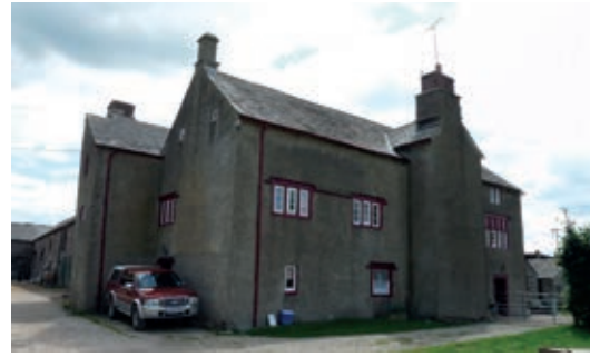
NO. 2 Barton Church Farm