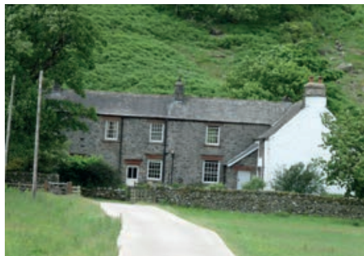
NO. 4 Hartsop Hall (owned by National Trust)