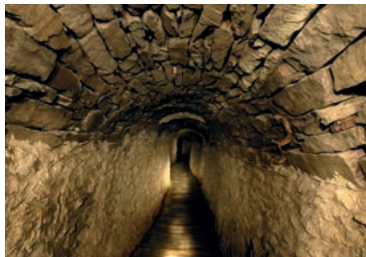
NO. 6 Greenside lead mine (owned by National Park Authority)