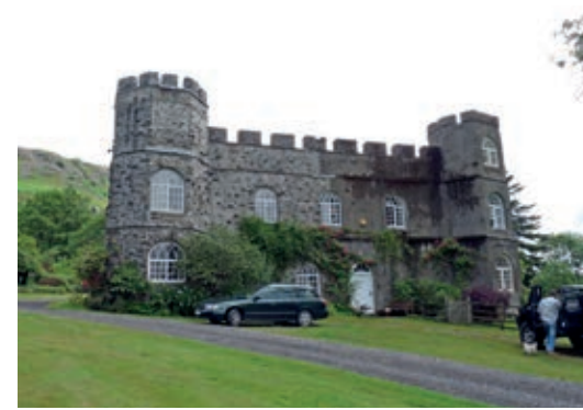
NO. 10 Lyulph's Tower