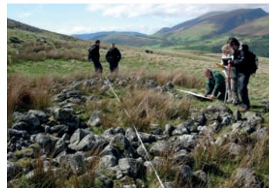
NO. 3 Remains of shielings north of Clough Fold