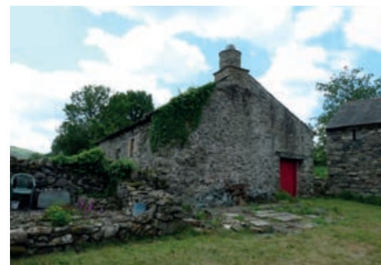
NO. 7 Hollin Root Old House