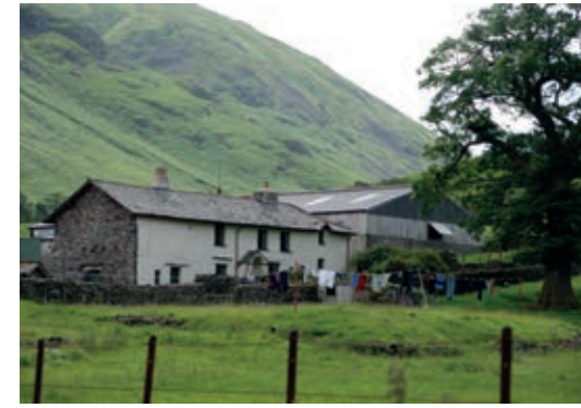
NO. 8 Steel End Farm