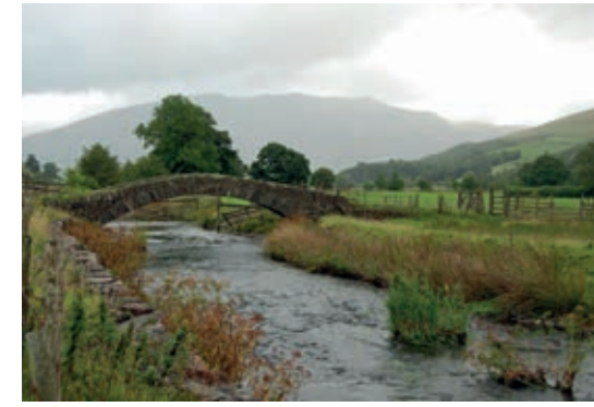
NO. 9 Sosgill packhorse bridge