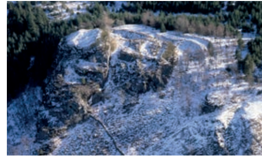
NO. 2 Shoulthwaite Hillfort