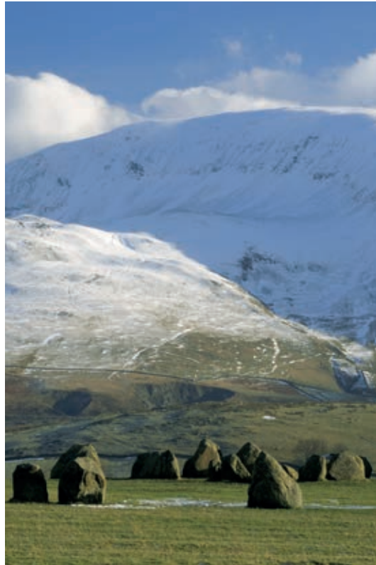
NO. 1 Castlerigg Stone Circle (owned by National Trust)

EXAMPLES OF KEY ATTRIBUTES: As shown on the Thirlmere illustrative map