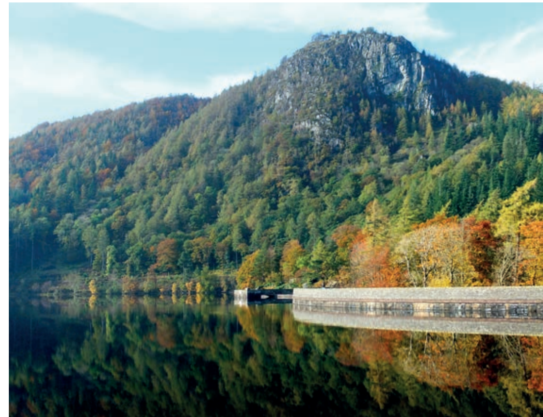
NO. 11 Thirlmere