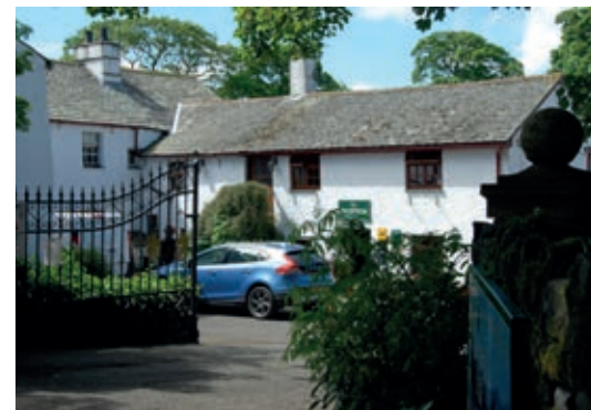
NO. 5 Castlerigg Hall