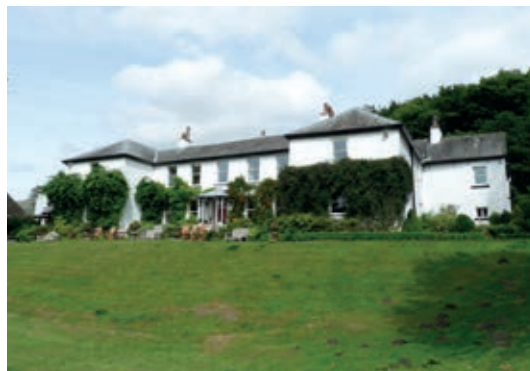
NO. 4 Dalehead Hall