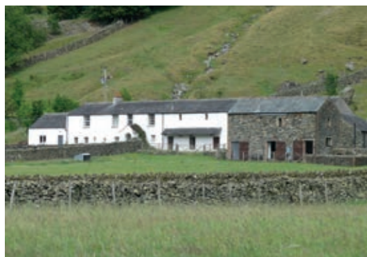
NO. 6 Fornside