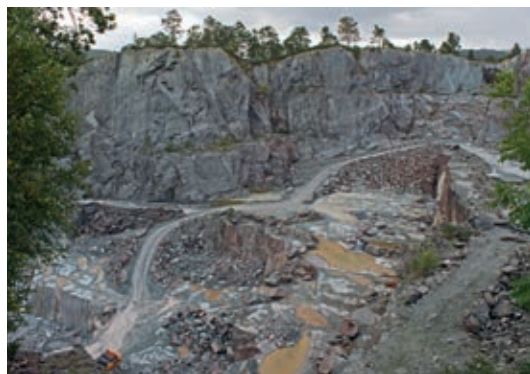
NO. 7 Elterwater slate quarry