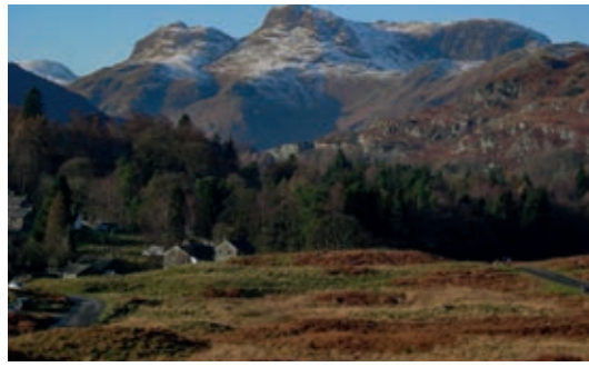
NO. 1 Pike of Stickle (location of Neolithic stone axe factories)

EXAMPLES OF KEY ATTRIBUTES: As shown on the Langdale illustrative map