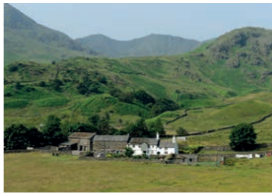
NO. 3 Fell Foot Farm (owned by National Trust)