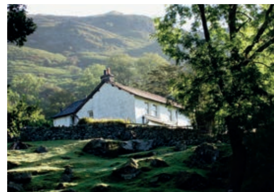
NO. 6 Robinson Place (owned by National Trust)