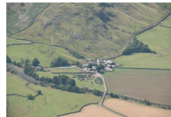
NO. 11 Stool End and Wall End farms (owned by National Trust)