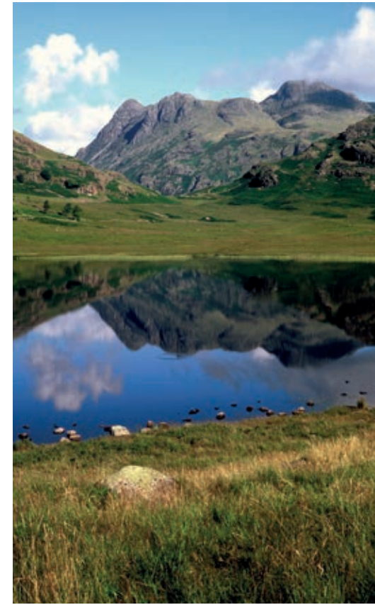
NO. 8 Blea Tarn (owned by National Trust)