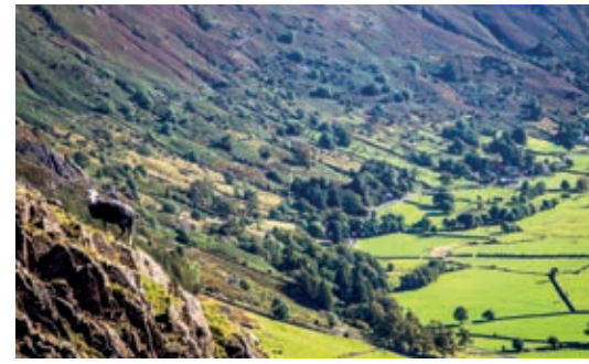
NO. 2 Intakes above Pye Howe (owned by National Trust)