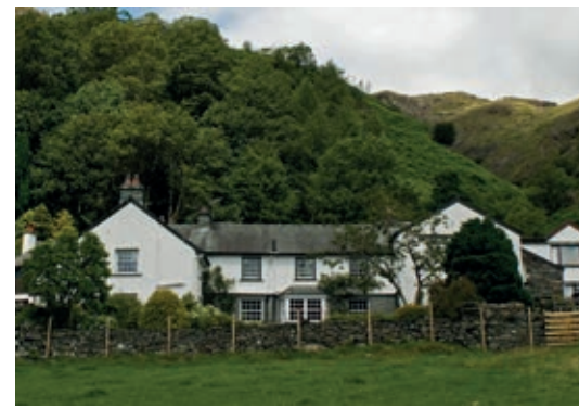
NO. 4 Walthwaite Farm