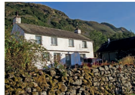
NO. 12 Busk Farm (owned by National Trust)