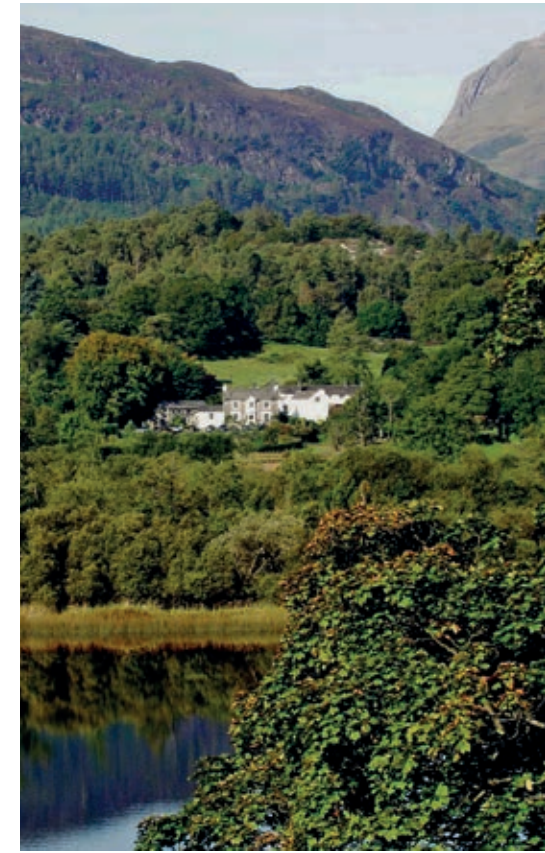
NO. 9 Eltermere Hotel