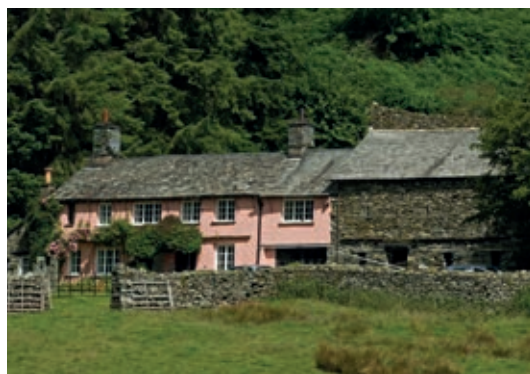
NO. 5 The Bield (owned by National Trust)