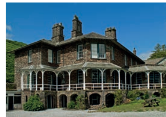
NO. 10 High Close (Youth Hostel, owned by National Trust)