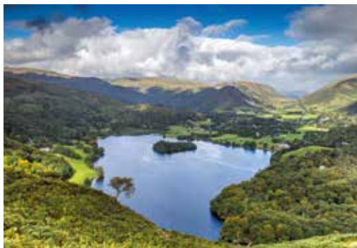
FIGURE 0.3 The Vale of Grasmere, at the heart of the English Lake District

Note on references: References have generally not been included in the text but are listed in the Bibliography in Volume 1. Those relating to individual valleys have been listed under valley subheadings in the Bibliography.