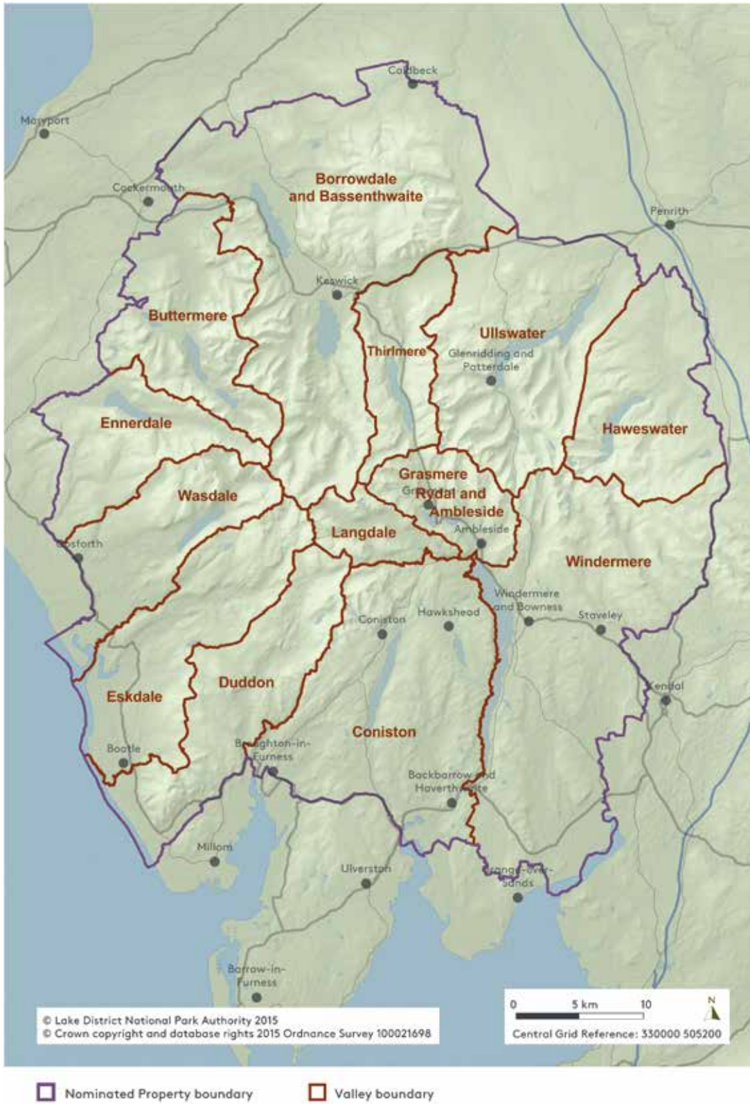
FIGURE 0.2 The 13 valleys of the English Lake District, based on William Wordsworth's description in his 'Guide to the Lakes' (1835)