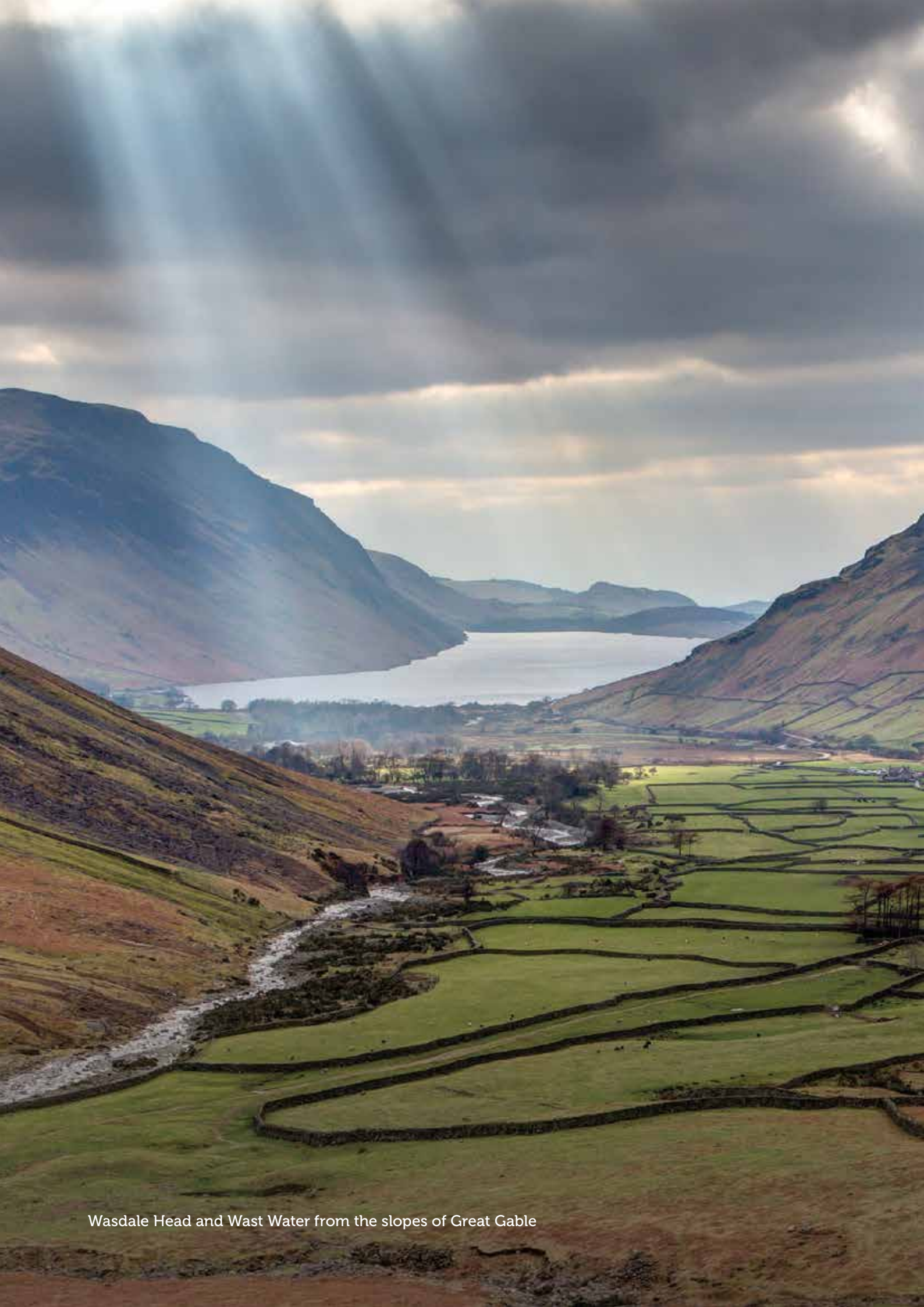
Wasdale Head and West Water from the slopes of Great Gable