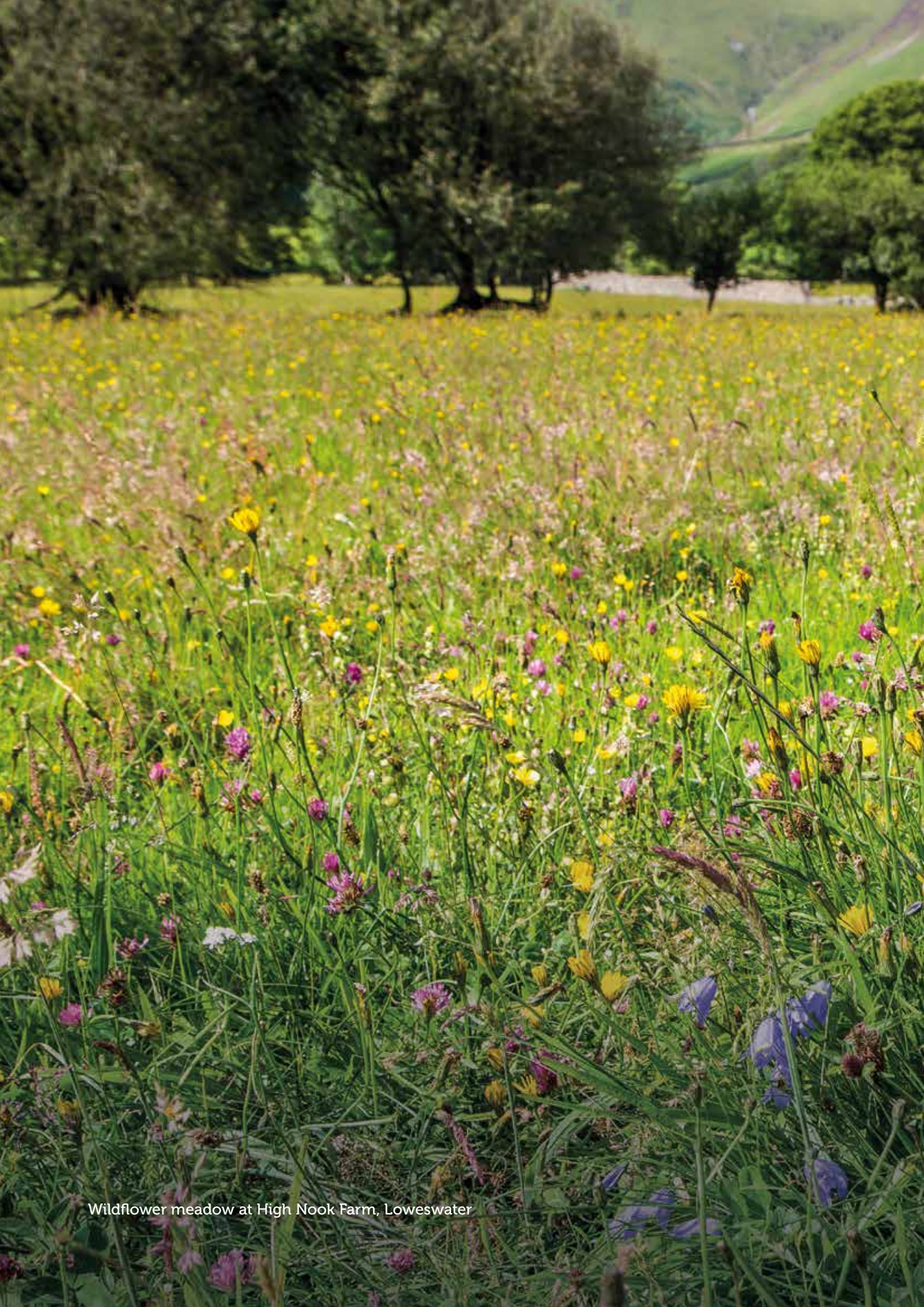
Wildflower meadow at High Nook Farm, Loweswater