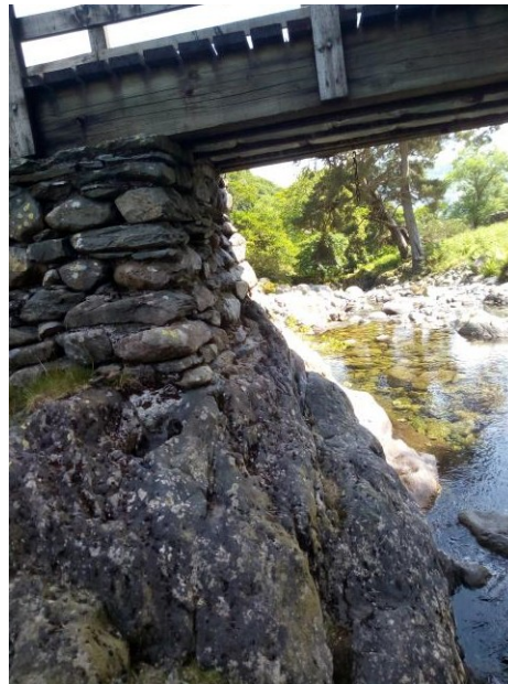
Abutment and beams