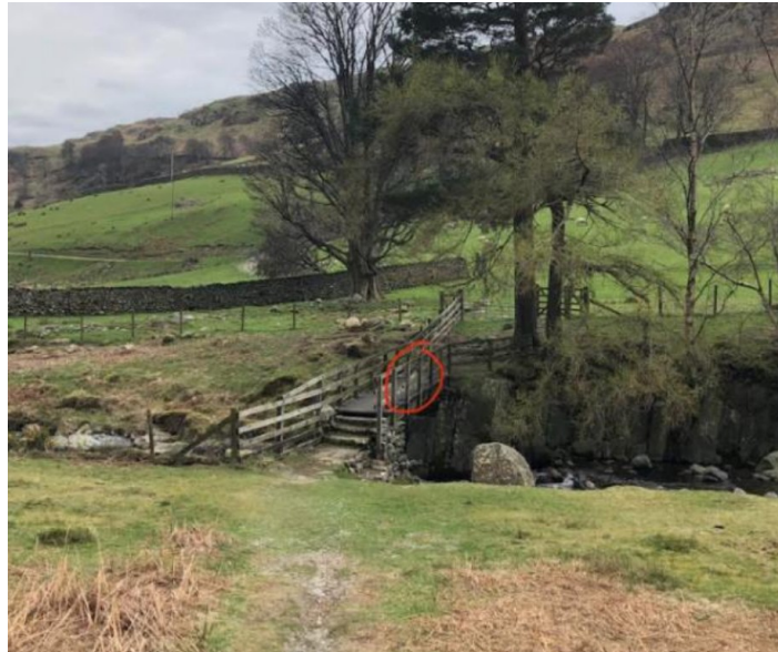
Red circle is from an inspection identifying issue with uprights / handrails