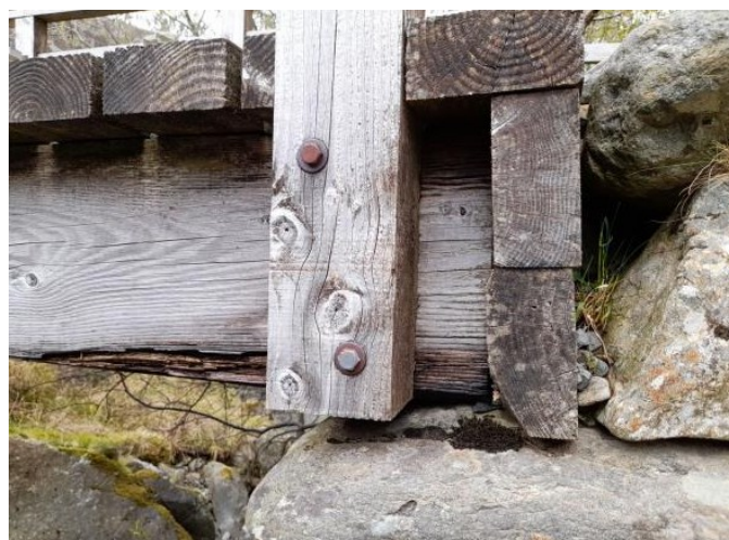
Rot of the upstream beam