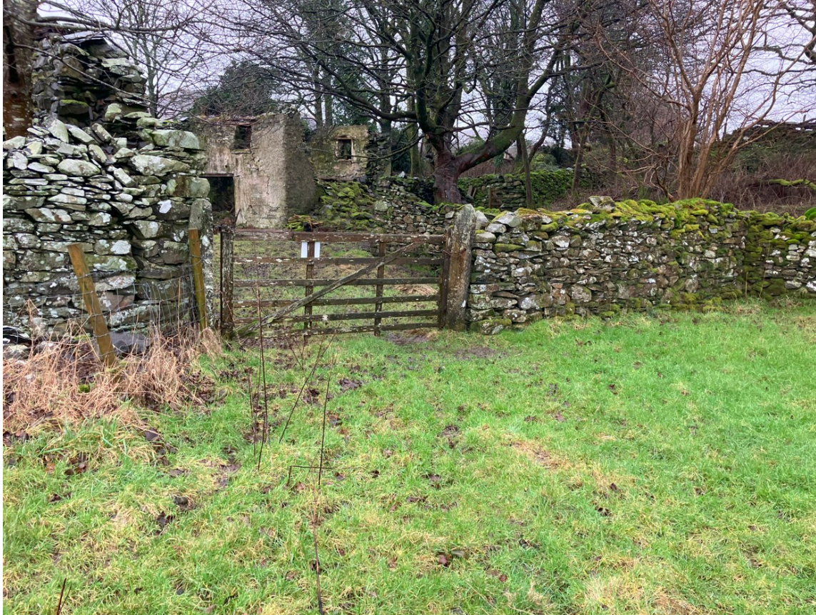
Facing north along footpath through farmstead from close to point B